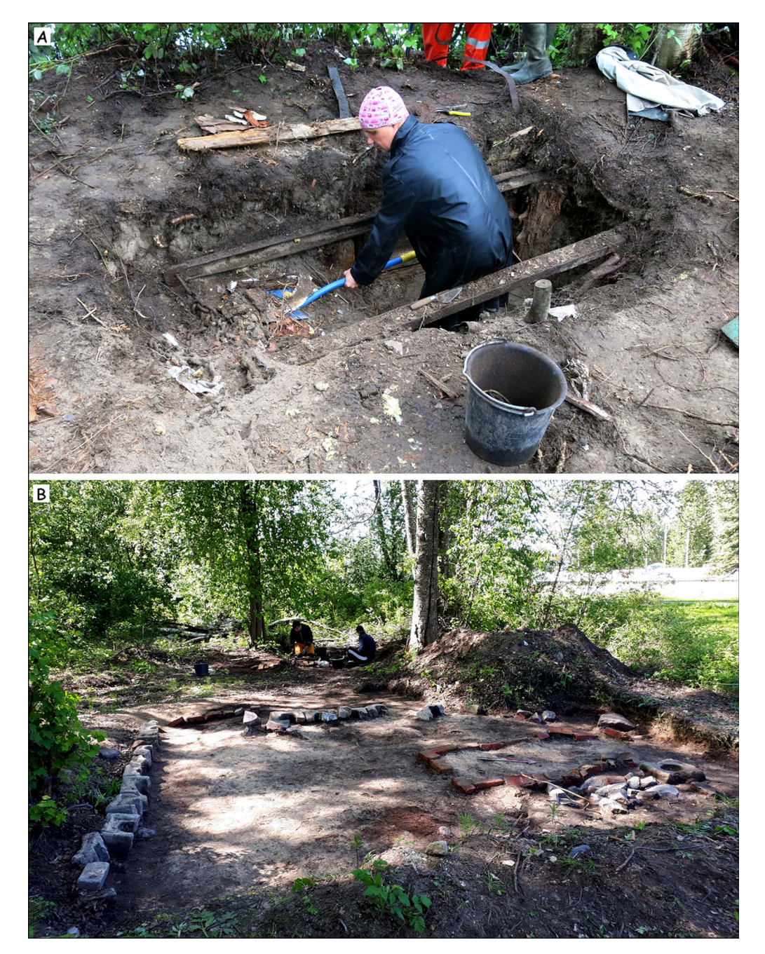
Figure 4. A) Vesa-Pekka Herva digging a German latrine; B) restructured wartime barrack foundations reinforced with German chimney elements, in the background is a flowerbed lined with German bricks (photographs by authors).

enhance the living standards, such as a wartime laundry barrack redesigned as a sauna (Figure 3), a nearby German latrine turned into a septic tank, and barracks refurbished as family housing (Figure 4).