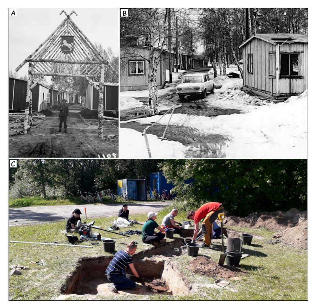
Figure 2. A) German soldier standing guard in Vaakunakylä during the war; B) Vaakunakylä in the early 1980s; C) field-school participants excavating the wartime horse-stable foundations at Vaakunakylä.

therefore, the Vaakunakylä barracks were preserved. In the late 1940s, Finns who were left homeless by the war moved into the barracks (Figure 2).