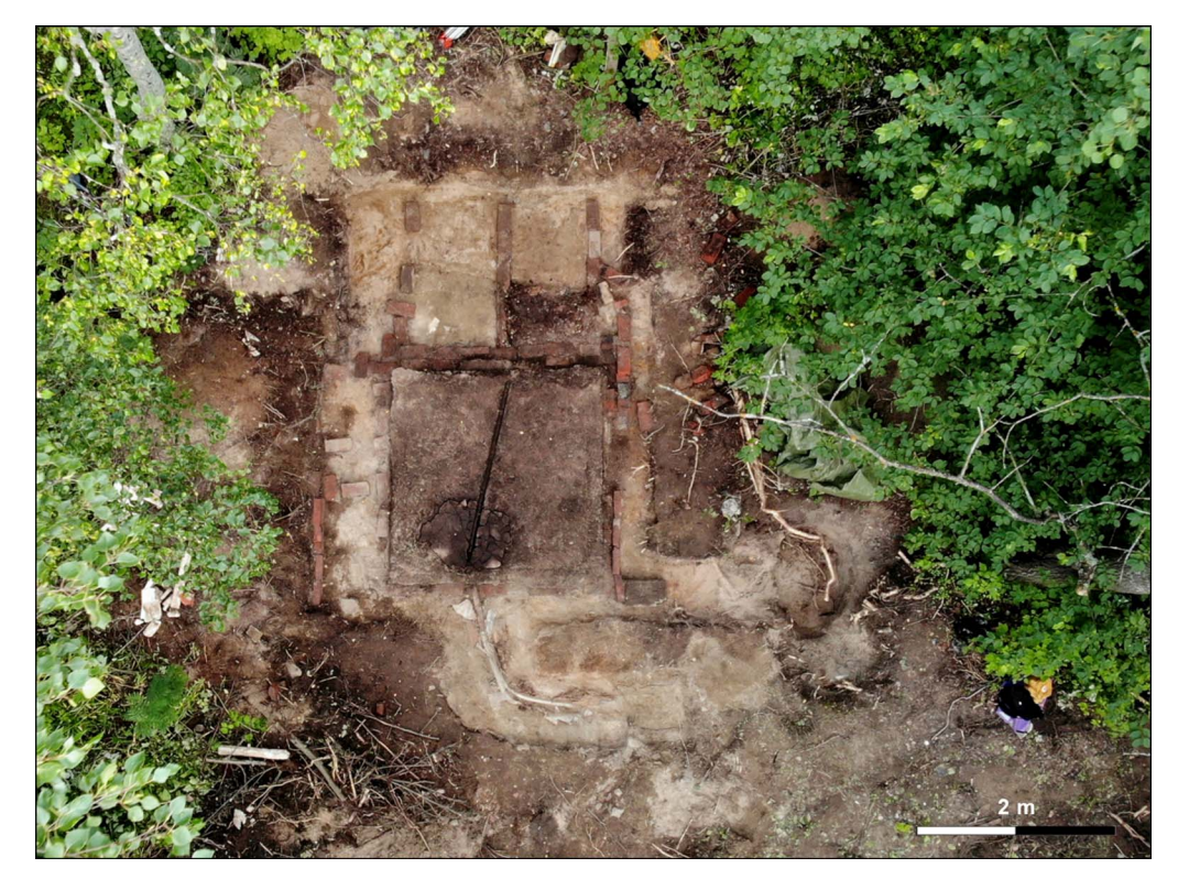
Figure 3. Foundations of a German laundry barrack turned into a sauna (photograph by authors).

philosophy, where nature became viewed as a commodity for public consumption (Matila et al. 2021). Also, the stigma attributed to Vaakunakylä of co-operating with the Nazis did not help. The City of Oulu had already taken measures to conceal the last reminders of Nazi past from the local landscape (Ylimaunu et al. 2013).