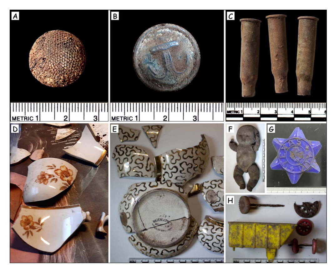
Figure 5. Finds from Vaakunakylä. A) German military button; B) Soviet military button; C) cartridges; D) Arabia Myrna cup fragments; E) fragments of a Sudlow's teapot; F–H) toys.

Numerous rubbish pits located in the area helped in reconstructing day-to-day family life. Only a few wartime finds were made, which is understandable as the Germans were in the area only for a couple of years and Finns lived there for four decades (Figure 5A–C). Pits contained mostly household waste, as there was no municipal garbage management in Vaakunakylä, which indicated variation between households in terms of possessions. For instance, sherds of high-end porcelain sets (Figure 5D & E) suggest that at least some Vaakunakylä residents could afford non-essential commodities to improve their living standards. Based on finds and recollections, locals took pride in their living spaces and were comfortable enough to entertain guests, which contrasts clearly with outsiders' low opinions of poorer areas.