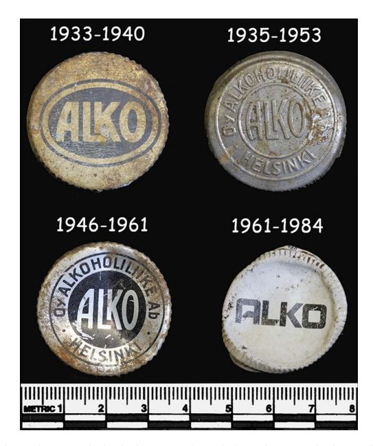
Figure 6. The 'bottle-top chronology' with finds from Vaakunakylä.

but, based on our contemporary archaeological explorations, alcohol bottle tops are among the most common finds in all twentieth-century contexts in Finland. We can trace what was consumed in different households based on the bottle tops and they also serve as horizon markers. We have established in our research a 'bottle-top chronology' based on the finds from Vaakunakylä that works as a tool for dating twentieth-century sites across Finland (Kelloniemi 2023) (Figure 6).