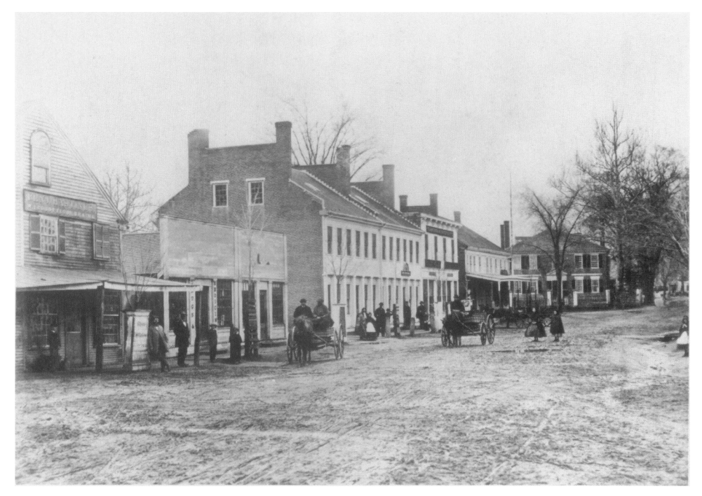
Plate 4: Concord in 1865.