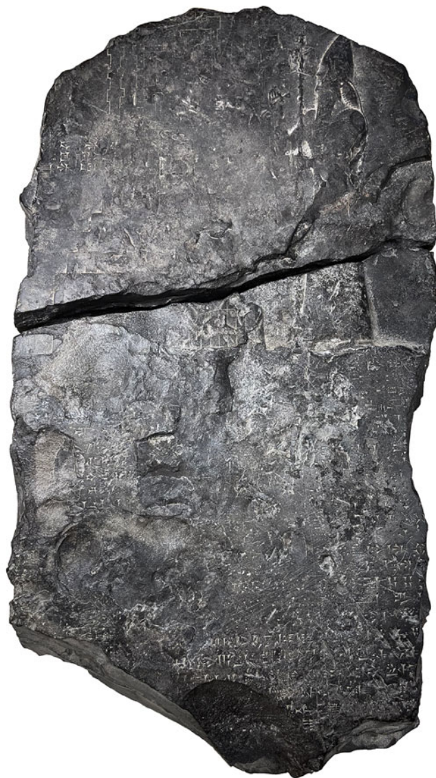
Fig. 1. Stele, 47 cm high, 25.5 cm wide, of black stone with pictures of the king Nebuchadnezzar II, of the front of the Etemenanki ziggurat in Babylon and a plan of the sanctuary on top of the ziggurat. A similar temple plan can also be found on the left edge. There is a short inscription beside the ziggurat and a longer one on the lower half of the front side. Previously MS 2063, Schøyen Collection, Oslo and London, now in Iraq Museum, Baghdad. Photo O. Pedersén 2023. Open Access.

was presented as a gift to the Iraqi authorities and will hopefully soon after conservation be on display in the Iraq Museum in Baghdad illustrating the original look of the ziggurat of Babylon.