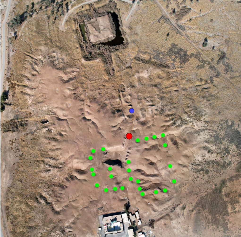
Fig. 2. Tell Amran in Babylon. The red marking in the trench is the approximate findspot of the two fragments of the stele depicting the ziggurat. To the south is the modern Amran sanctuary. The Esagil temple of Marduk is marked by the large pit with the surrounding green dots showing still visible upper parts of later pits from excavation. The blue marking is a Parthian house where many broken precious objects were excavated. North of the tell are the remains of the 90 x 90 m Etemenanki ziggurat with the preserved 60 x 60 m mud brick core and in the surrounding water the 15 m wide baked brick mantle. Background and additions by O. Pedersén 2024. Open Access.