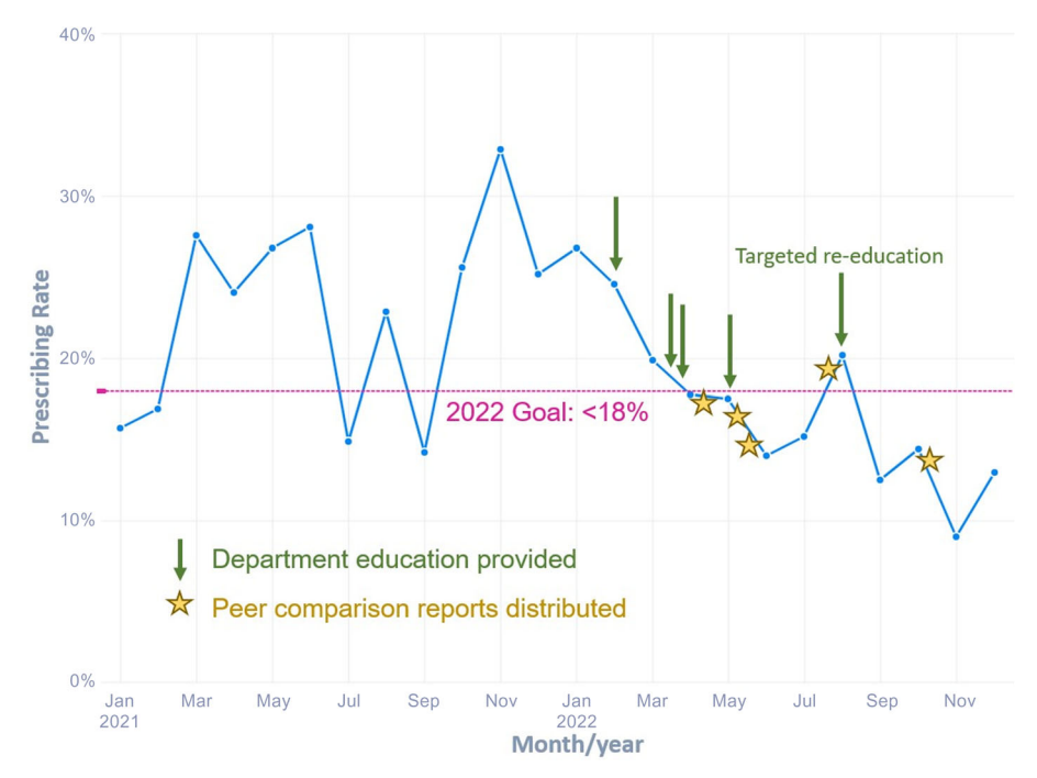
Figure 1. Prescribing rate for tier 3 encounters over time.

departmental prescribing data, education on appropriate indications for antibiotics, patient-centered strategies for reducing antibiotic use, and a review of electronic resources developed specifically for the project. The resources included a syndromic ambulatory order panel (EZ ID Respiratory Order Panel) and a viral "prescription pad," which contains simplified over-thecounter recommendations for symptomatic management of viral URIs, as well as patient education.<sup>6,7</sup> Providers were also shown how to optimize Epic preferences to Tier 1 and 2 diagnoses to facilitate selection of the appropriate diagnoses. Additionally, we provided quarterly peer comparison reports (sample in supplemental material) to the department chairs and site leads (Figure 1). Focused re-education was provided based on provider prescribing performance. This study was deemed exempt from IRB approval.