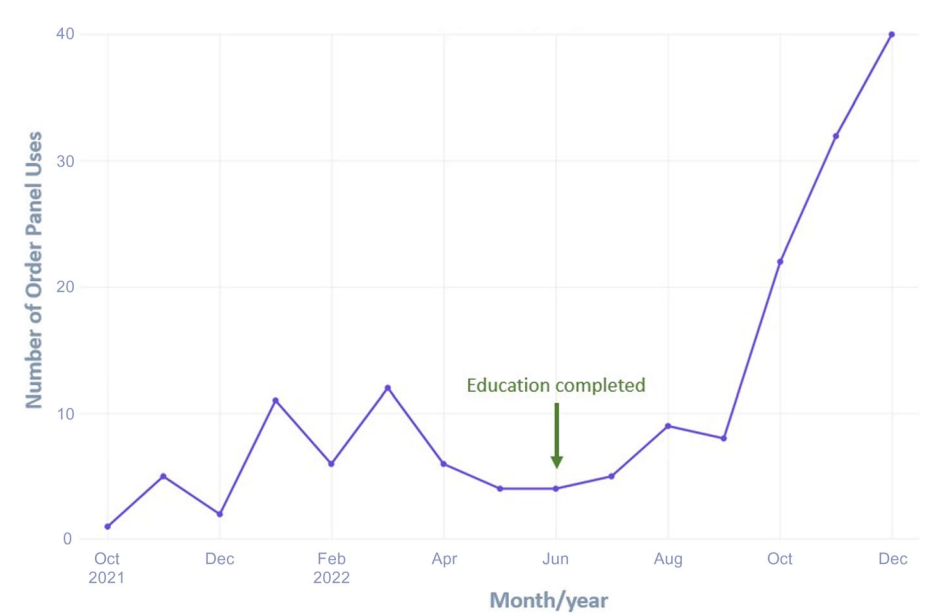
Figure 2. Number of Encounters using EZ ID respiratory order panel.