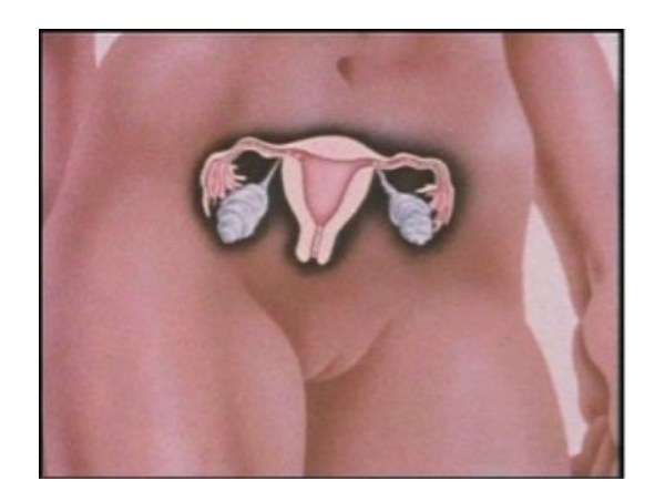
Figure 3: Diagram of the female reproductive system from 'To Mrs Brown... A Daughter'.

the process of conception, which they spliced with footage of sperm under the microscope and stills of embryos and foetuses. They drew these animations themselves, in consultation with Edwards and Steptoe. They are reminiscent of the images many viewers would have seen in educational videos in biology class at school (Figure 3).