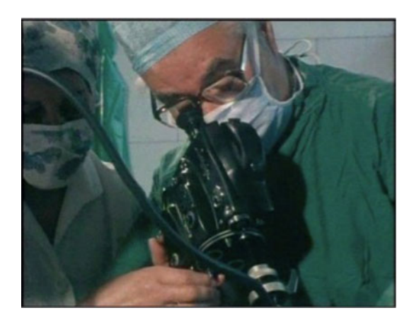
Figure 5: Steptoe films his laparoscopy in 'To Mrs Brown... A Daughter'.