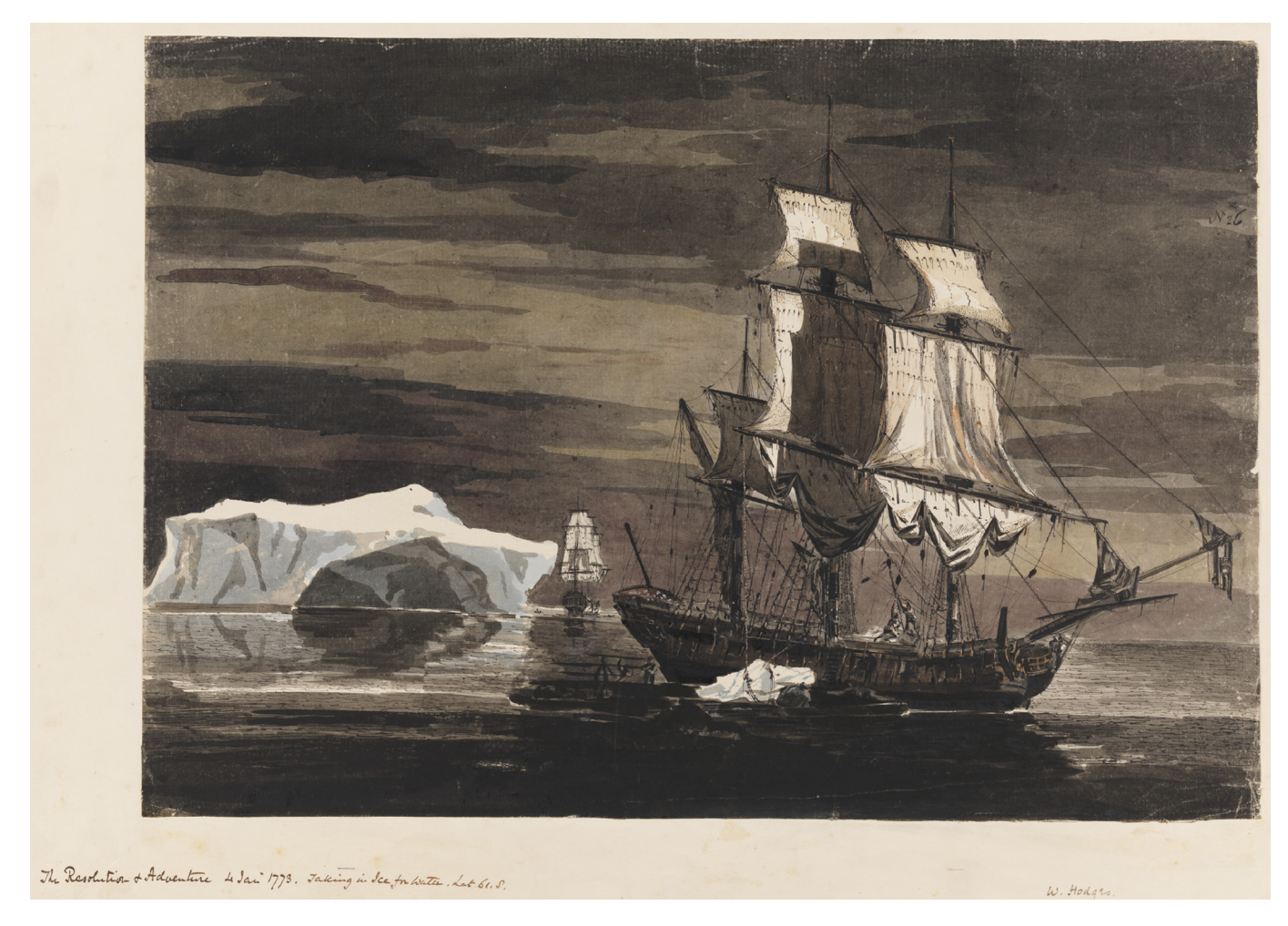
Fig. 1. Watercolor by William Hodges, dated 4 January 1773, with the caption The Resolution and Adventure, taking on ice for water, Latitude 61 S. The illustration corresponds to the ice recovery described in Cook's log on 8 January 1773 at 61.2°S, 31.8°W. For scale, the Resolution measures 100 m at the waterline. The image is out of copyright and courtesy of the Mitchell Library, State Library of New South Wales (Mitchell Library, 2022).

his first traverse in the Weddell Sea, Cook recovered small pieces of glacier ice from the sea and found that they yielded fresh water (54.8°S, 21.5°E). On 8 January 1773, Cook deployed three boats, and in ~6 h, recovered enough ice from an iceberg to yield 'fifteen tons of good fresh water'. Cook realized that icebergs could supply his fresh water needs, and that 'I did not doubt of getting more whenever we were in want. I therefore, without hesitation, directed our course more to the south... (Cook, 1777a, 88)'. Figure 1 shows a watercolor of the two ships and the ice recovery by the artist on the Resolution , William Hodges.