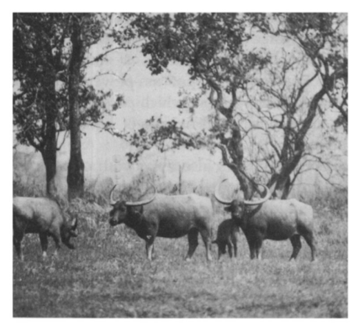
The alluvial grasslands of Manas hold the best population of the endangered wild buffalo ( Goutam Narayan ).

Another problem is the Central State Farm in Kokilabari, which was established in 1971 and occupies nearly 20 sq km in the eastern part of the core area of the sanctuary. In 1976