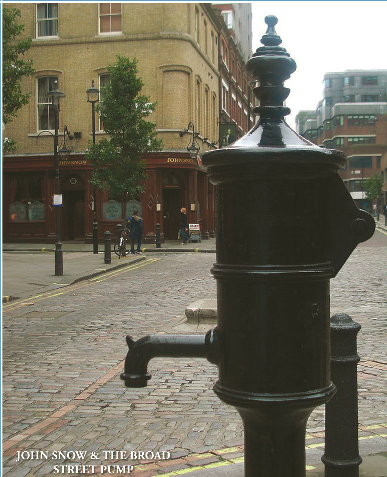
JOHN SNOW & THE BROAD STREET PUMP