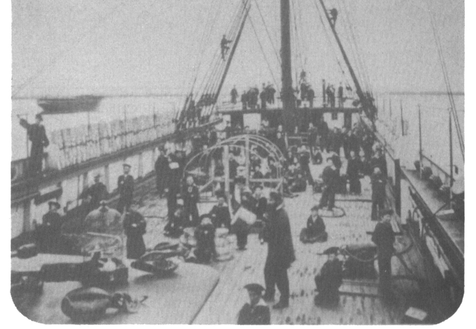
Penal Hulk Deborah?

In 1860 after strenuous negotiations with the government the former Institution for Houseless Immigrants (called the Public