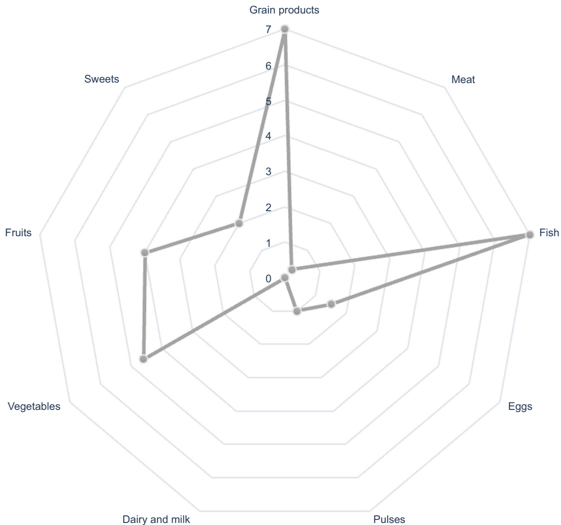
Fig. 2 Average weekly frequency of consumption of 9 different food groups, derived from the 10 categories of the MDD-W

though the category of vegetables is reported to be consumed daily by 71.9% of the population. Failure to meet RDAs of calcium, iron and zinc, must be highlighted, considering their centrality covered by those micronutrients in the correct development of the foetus and the state of maternal health. This could be due to the rare consumption of milk, dairy products, legumes, meat and poultry.