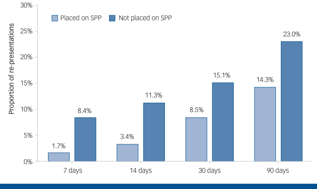
Fig. 1 Re-presentations with a suicide attempt at 7, 14, 30 and 90 days, by placement on the suicide prevention pathway (SPP).