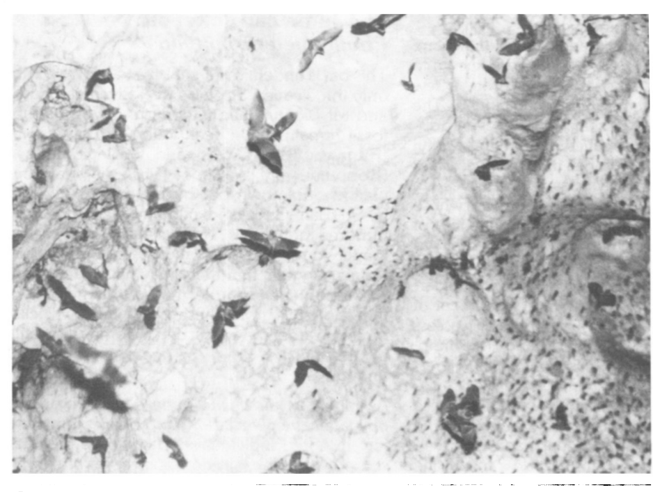
Bats in the roof of Oxford Cave, Jamaica.

on pollen and nectar feeding, so that it is likely that the species would exhibit a dietary shift from pollen and nectivory in the dry season to frugivory in the wet season. Goodwin (1970) reports a female with embryo taken in late January, but nothing else is known of the species's reproductive habits.