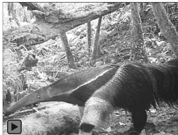
PLATE 1 A giant anteater Myrmecophaga tridactyla and its habitat in the highland areas of dense rainforest (Atlantic Forest sensu stricto), in southern Brazil.

The giant anteater Myrmecophaga tridactyla (Mammalia, Pilosa, Myrmecophagidae) is a large mammal with a wide geographical distribution. It originally occurred from northern Central America to southern South America (Miranda et al., 2014a) but is now considered to be rare in some regions, with low population densities (Braga, 2009). The species' life-history traits, including diet specificity, low