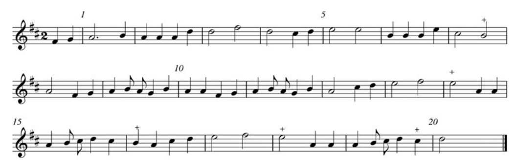
Example 1 Anonymous, 'Les rats', vaudeville tune in Alain-René Lesage and Jacques-Philippe d'Orneval, Le théâtre de la foire, ou l'opéra comique (Paris and Amsterdam: chez Z. Chatelain, 1722–1734), volume 1, page 15 (of the Table des Airs). British Library 241.I.18-27. The clef has been changed from its original soprano clef to modern treble clef, and the order of the sharps has been modernized

We know from newspaper advertisements that at least three of the pieces from the Lesage and d'Orneval collection were performed in London. These are Les eaux de Merlin (premiered 12 December 1721), L'isle des Amazones (17 December 1724) and Les funerailles de la foire (8 January 1724), and all were produced at the Little Haymarket Theatre (refer to the Appendix). Perhaps Gay even heard the tunes sung live during their