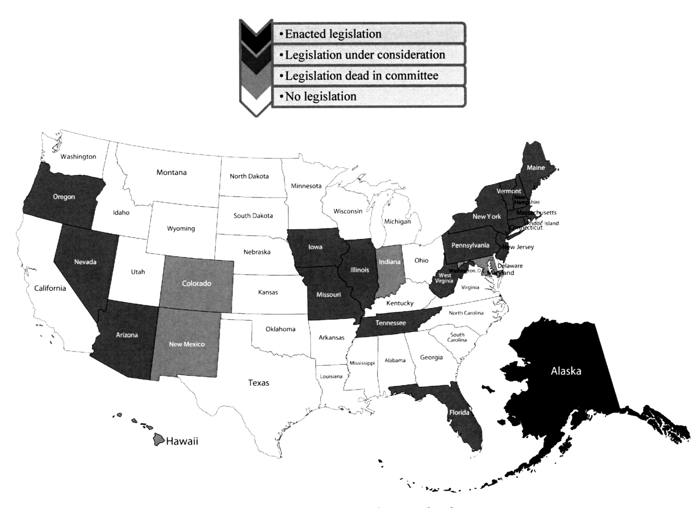
Figure 2. Current status of GM food labeling legislation at the state level

mandatory labeling of GM foods. This regulatory trajectory has been solidified by the Supreme Court in the case of Hudson Gas & Electricity Corp. v. Public Service Commission of New York and a number of rulings against labeling by state courts based on that legal precedent. In contrast, the EU has remained steadfast in opposition to GM food since the 1990s. Consistent suspicion of GM food as something unnatural coincided with the strengthening of the precautionary principle and the adoption of strict labeling standards across the EU.