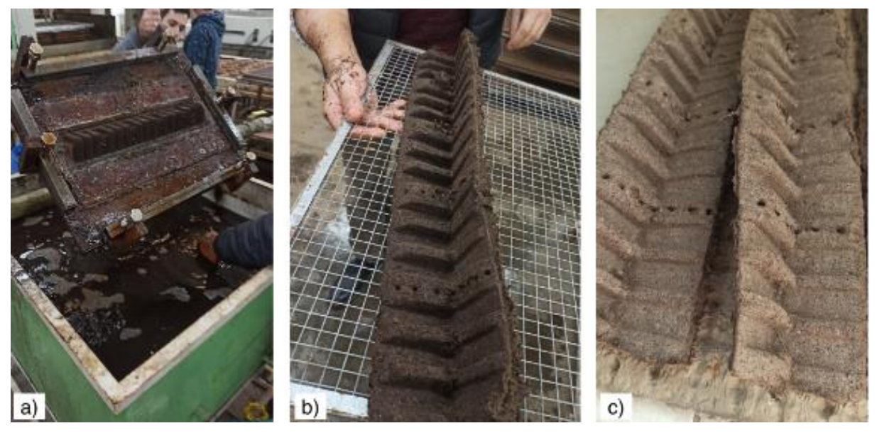
Figure 2. a) a) Manual transfer molding machine; b) Molded piece with cellulose and coconut powder before drying; c) Dry molded piece.

The transfer molding tests were carried out in a molded pulp packaging converter industry located in São Bento do Sul, a city in the state of Santa Catarina, Brazil on September 29th, 2022. To develop this study, dehydrated coconut residues in long fibers and powder mixed with water were used. The tests were carried out on a manual machine with an angle die for forming (Figure 2.a), resulting in the following scenarios: a) long fibers and pure coconut powder were not suitable for this process, because even if there were mixers at the bottom of the tank, the material settled and did not stick to the mold; b) as cellulosic fibers were added to the mixture (pre-consumer cardboard scraps, supplied by packaging companies), better results were observed in the agglutination of the fibers among themselves and in the molding; c) the best result observed contained a mixture of 50/50 cellulose pulp and coconut powder. In this composition, it was possible to shape the piece and dry it with little deformation (Figure 2.c).