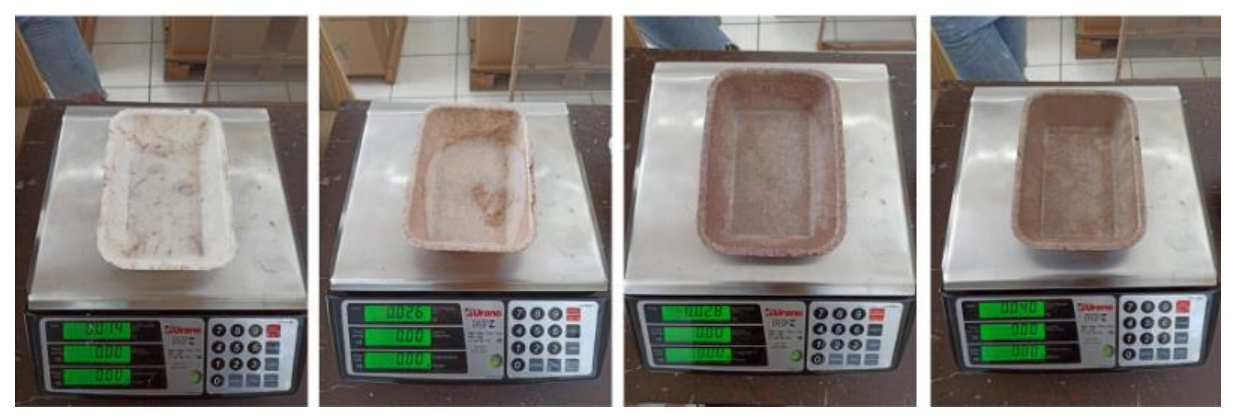
Figure 4. a) Visual result and the weight (in grams) of each composition test

The mixtures were made manually (Figure 3.a) and thermoformed at the same time (3'3") and at the same pressure (20 bar). The addition of water in the compositions varied according to the texture and volume they presented during mixing. All compositions had satisfactory conformation results, however, due to their composition and water evaporation, they revealed very different final weights (14g, 26g, 28g, and 40g, respectively), as shown in Figure 4.