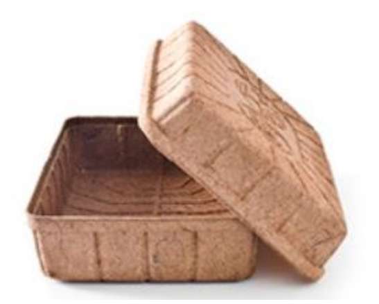
Figure 1. Coconut-fiber-based packaging example

Among the eight Brazilian companies of the group, it was possible to observe that they use, in higher proportion, maize or wheat straw, cassava starch, or sugarcane bagasse in their packaging manufacturing. In some cases, it is not used only a single input in the composition, being possible to mix bamboo fibers, wood sawdust, or rice husk. In the other countries, besides the material already used in Brazil, companies that use less-conventional raw materials, like banana stems, coconut fibers (Figure 1), hemp straws, and vine blocks, among others, were found. Besides, less than half produce from subproducts' inputs, that is, agricultural residues that are not treated or reused in the production chain.