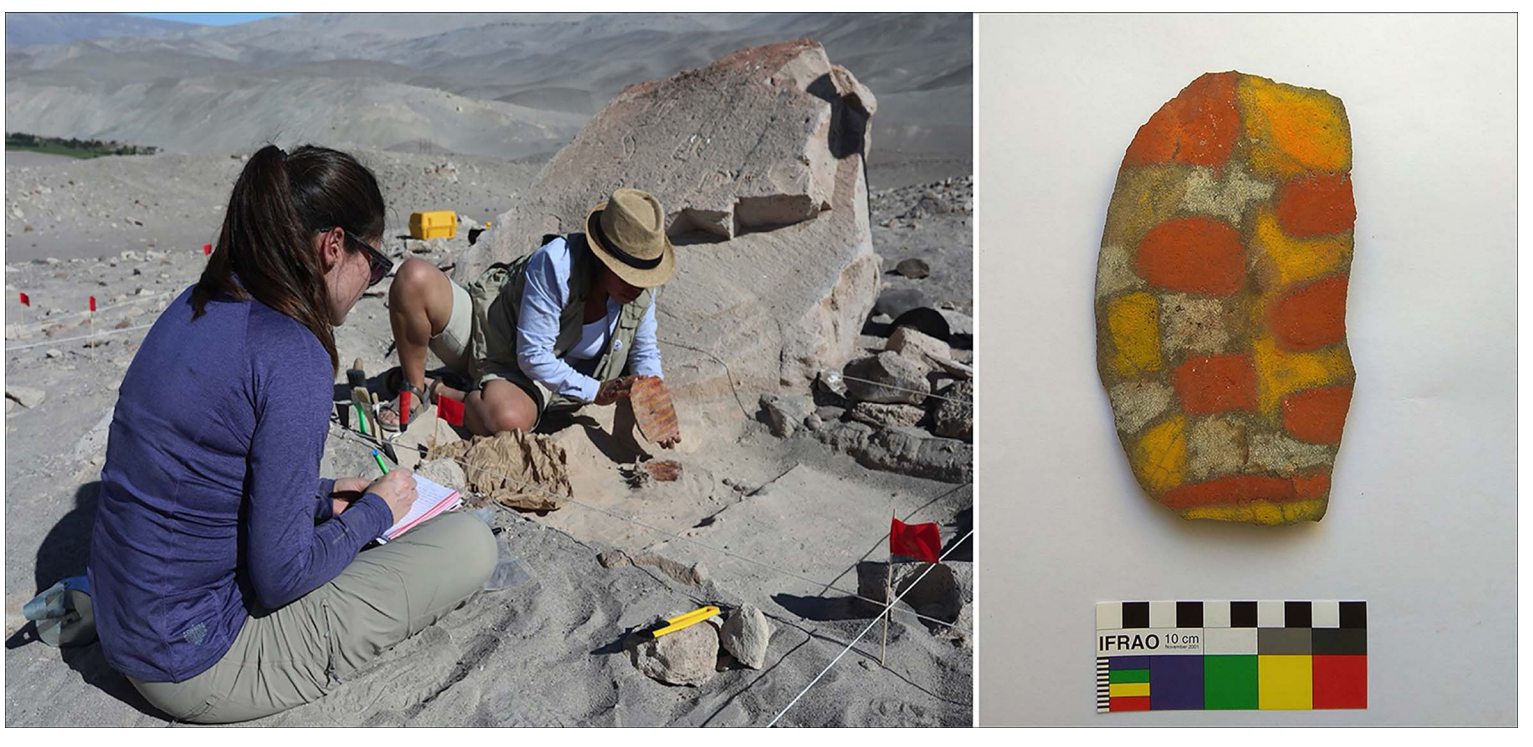
Figure 6. Votive stone tablets painted with vivid colours (right) were popular offerings to deposit (left) next to boulders.