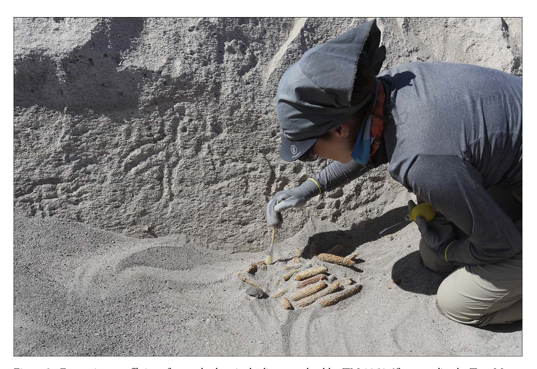
Figure 5. Excavating an offering of corncobs deposited adjacent to boulder TM 0252.