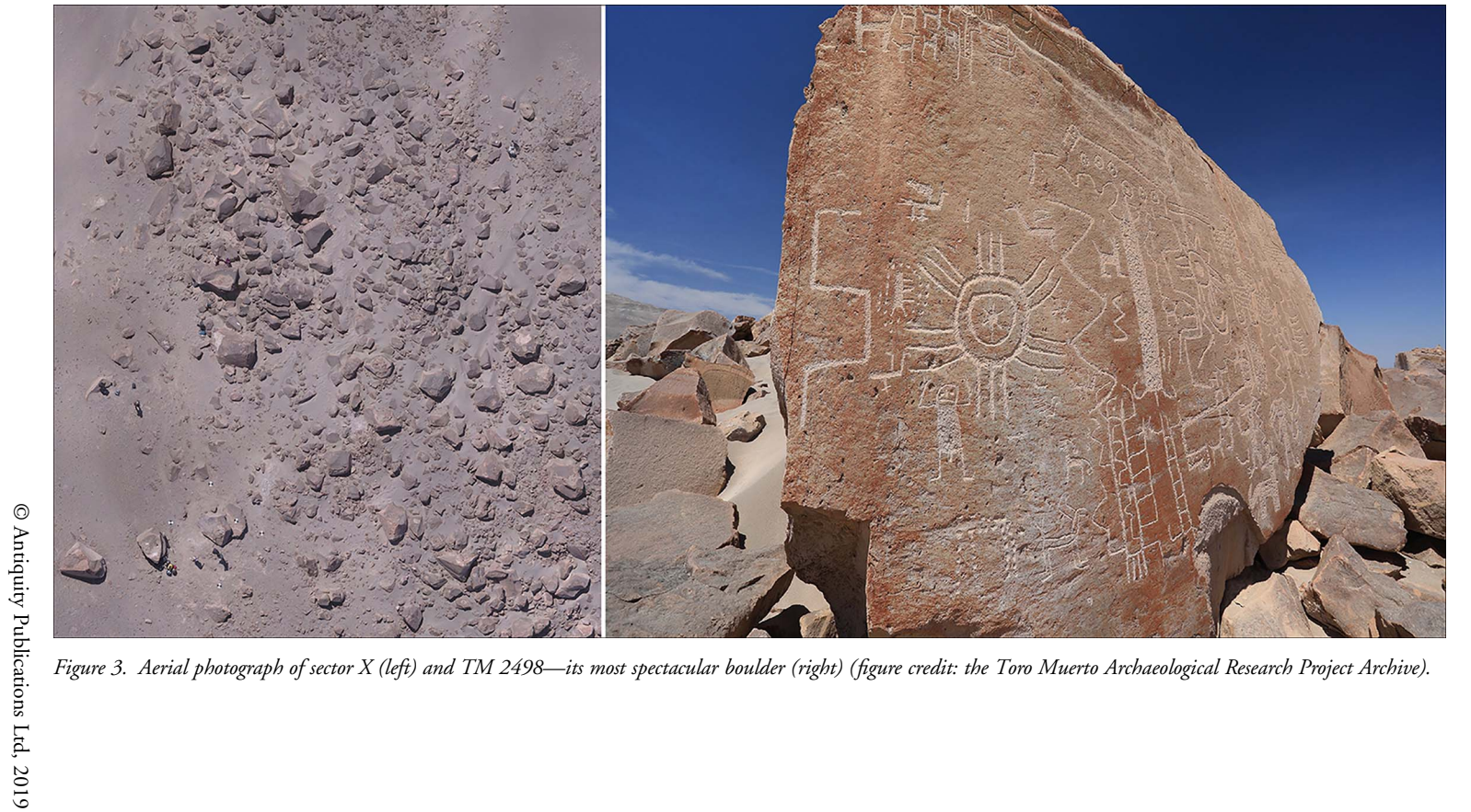
Figure 3. Aerial photograph of sector X (left) and TM 2498—its most spectacular boulder (right).