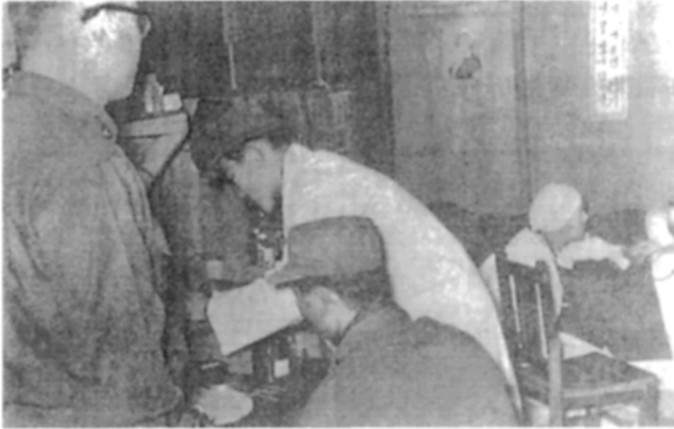
Figure 3. The Republic of Korea Army's Department of Blood Transfusion in 1953 (Source: Kim et al. 1999, 45).

serological anthropology. First of all, since the closing of the Institute of Legal Medicine at Keijō Imperial University Medical School and the establishment of Seoul National University College of Medicine in 1946, there was no longer a research institute for serological anthropology in Korea. Furthermore, research at most medical schools was paralyzed by the political struggle between right and left (Kim 2015). With the scarcity of basic supplies in the aftermath of the Pacific war, blood-typing reagents were also in short supply nationwide (Kim et al. 1999). Lastly, the United States Army Military Government in Korea and later the South Korean government did not allocate much of their budget to basic scientific research. In the government's view, there was no reason to support a survey of blood group distribution in Korea. Instead, they committed to public hygiene programs like cholera prevention (DiMoia 2013). Under these circumstances, there were no medical scientists carrying out blood-group research, despite their knowledge of serological anthropology based on the biochemical race index.