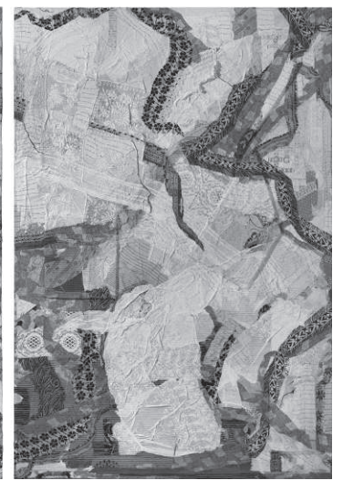
FIG. 2 Peter Sacks, Kyoto Protocol.