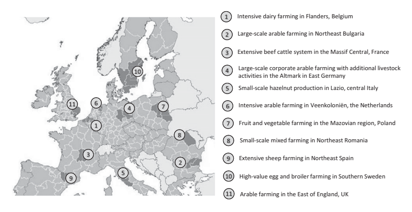
Figure 1.2 The eleven farming systems included in the SURE-Farm assessments.

suppliers and supply chain actors – are enabled by regional environments and deliver the specific functions of the farming system, in particular agricultural products and public goods. The SURE-Farm approach was applied to eleven farming systems which represent different challenges, farm types, agro-ecological zones, products and public goods (Figure 1.2).