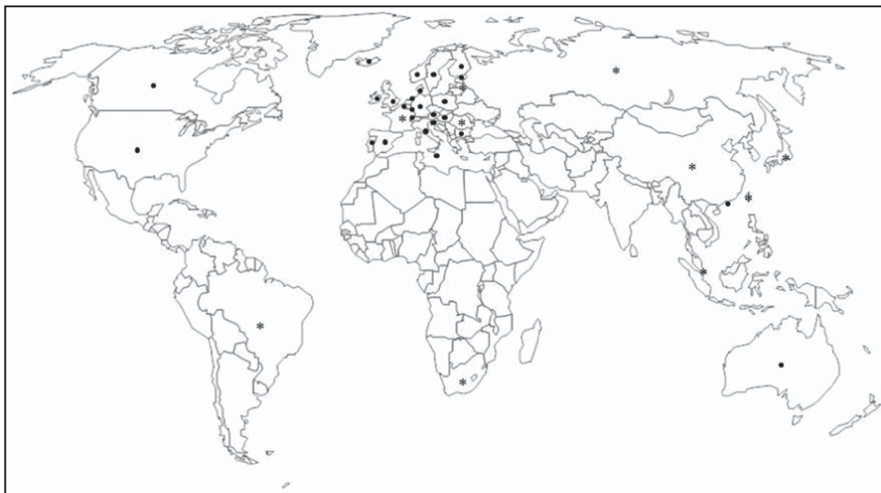
Fig. 1 World map showing the thirty-six countries in which recommendations for folate and folic acid intake in the periconceptional period were analysed (●, country with official validation; *, country without official validation)

From the forty-six countries initially considered, ten (21.7%) were excluded – six in the EU (Croatia, Cyprus, Czech Republic, Greek, Lithuania and Slovakia), two European countries not belonging to the EU (Liechtenstein and Turkey), one BRICS country (India) and one Asian Tiger/Asian Dragon country (South Korea) – on the basis of data being unavailable or not found. Thus a final sample of thirty-six countries was obtained: twenty-two in the EU (Austria, Belgium, Bulgaria, Denmark, Estonia, Finland, France, Germany, Hungary, Ireland, Italy, Latvia, Luxembourg, Malta, Netherlands, Poland, Portugal, Romania, Slovenia, Spain, Sweden and UK), three European countries not belonging to the EU (Iceland, Norway and Switzerland), four BRICS countries (Brazil, Russia, China and South Africa), three more G8 countries (the other five were already stated in EU and BRICS; Canada, Japan and USA), three Asian Tiger/Asian Dragon countries (Hong Kong, Singapore and Taiwan) and Australia; see Fig. 1.