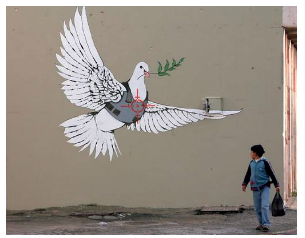
Picture 5. (Dove in Flak Jacket)

avoided. And secondly, with an eye to future research in this area, the multiple forms of irony be it national or religious, or otherwise, surely require some attention?