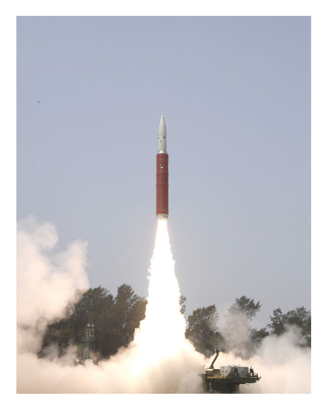
Figure 8.2 Defence Research and Development Organisation ballistic missile defence interceptor being launched for ASAT weapon test in March 2019.

The second strand, emerging from the same practice and an accompanying opinio juris may be the development of a parallel rule of customary international law. Ultimately, our analysis leads us to the conclusion that this change, too, is now under way.