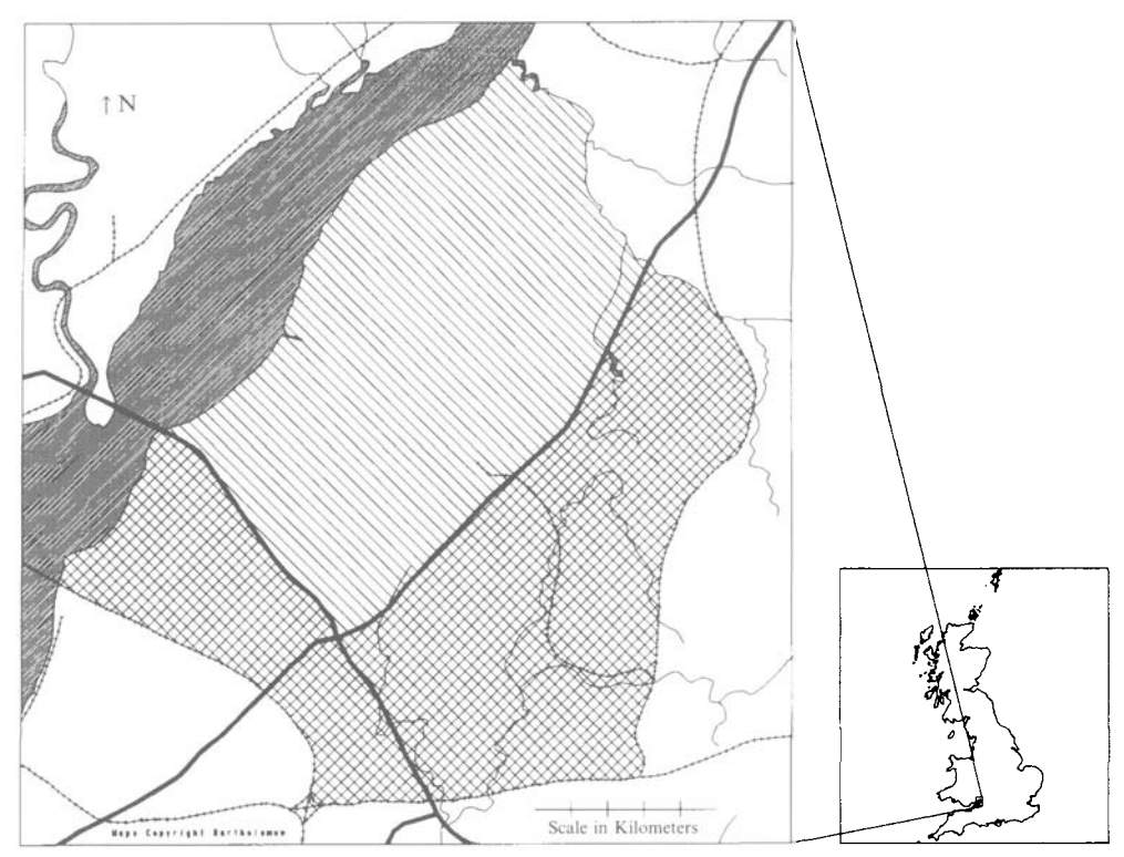
Fig. 1. Intervention (\boxtimes) and comparison (\boxtimes) areas, with tidal estuary (\boxtimes) , motorways —, railways —, and major rivers —.