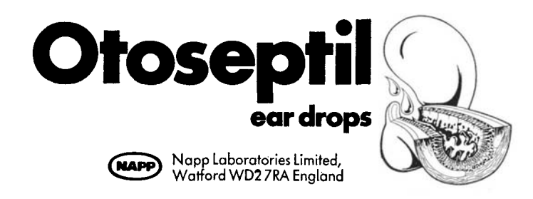
Please mention The Journal of Laryngology and Otology when replying to advertisements