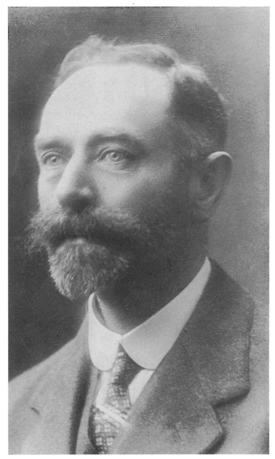
Figure 3 Sir Rudolph Smith, Bt., C.B.E., F.R.C.S. (1869–1958), a member of the practice from 1897 to 1912.