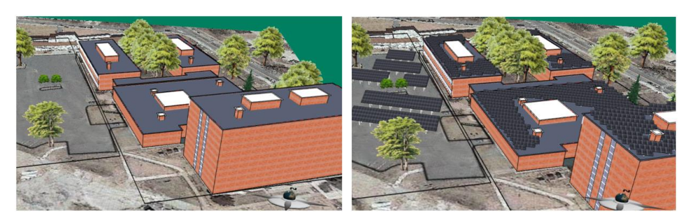
Figure 2. Left panel: the model in which participants began their design. Right panel: An example of a submitted design that met the goals and constraints.

Through internal testing, constraints and goals were fine-tuned to create an intricate design problem consisting of many interrelated variables for the designers to manipulate in the design process. The challenge was created to both encourage designers to engage in systems thinking and to give them a large design space to explore as they worked through the design process. Designers were told that the problem was open-ended and that there was no single correct solution. They were encouraged to work in an iterative process throughout the week to create a design that met the goals and the constraints.