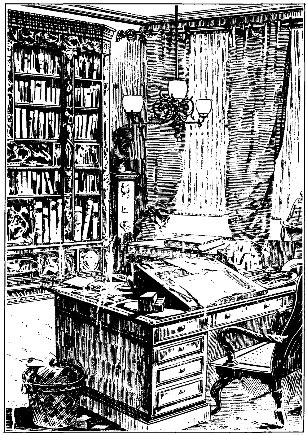
Pall Mall Budget, 19 Dec. 1889