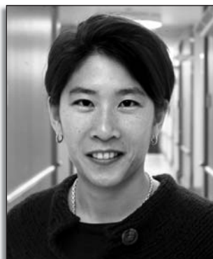
Teri W. Odom

Odom's pioneering large-area nanoscale fabrication techniques have enabled investigations on nanoscale plasmonics. Her research group focuses on optical properties of nanohole arrays in metallic films, nano-pyramids, and multilayered nanoparticles; all reveal surprising phenomena. Using near-field scanning optical microscopy, Odom has imaged how surface plasmons form standing waves between nanoholes and how these waves can be manipulated by changing the material or the wavelength of the incident light. Combining near-field, far-field, and modeling techniques to investigate large-area nanohole arrays, Odom provided direct, conclusive evidence for the role of surface plasmons in the enhanced transmission.