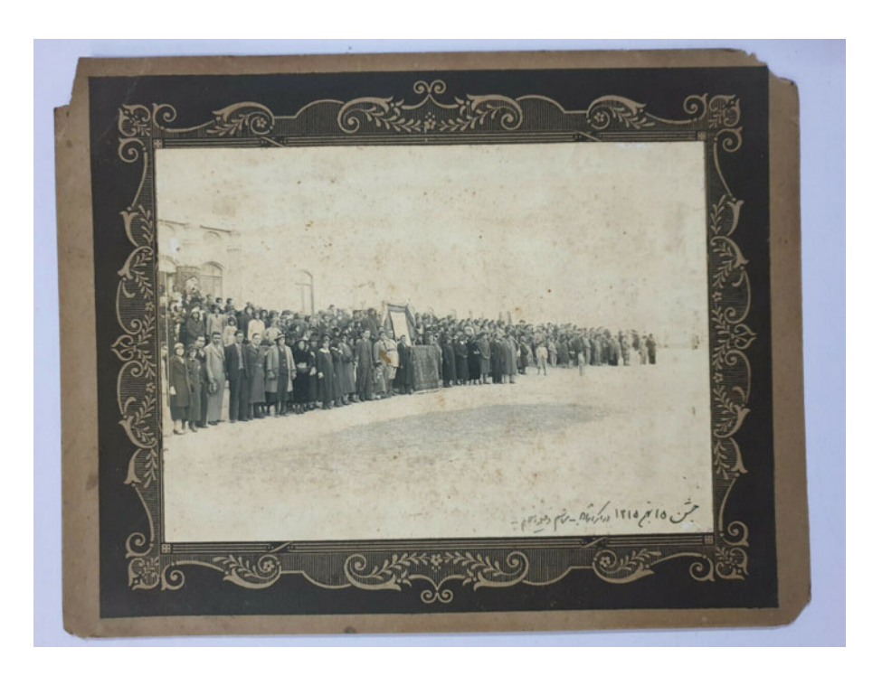
Figure 13. Adults standing in front of Marker Orphanage and School. The caption reads, "15 of Bahman Celebration, 1315 [Feb. 4, 1937] in Markerabad—welcoming and appreciation ceremony."