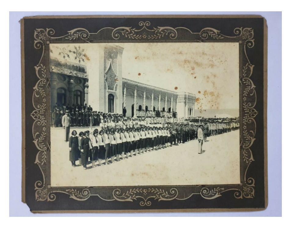
Figure 16. No caption or inscription on reverse. Girl Guides and Boy Scouts in uniform standing in front of Central Hall of Marker Orphanage and School.

graduates (Figures 11–12), scenes of which conveyed a shared Parsi-Iranian Zoroastrian progressivism as well as the achievements of the Iranian Zoroastrian Anjoman (as John Hinnells notes, a significant number of the Anjoman's properties in Iran were dedicated to female education).<sup>1</sup>