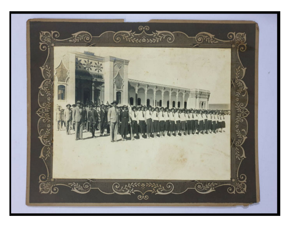
Figure 17. Girl Guides and Boy Scouts of the Marker schools standing in formation in front of Central Hall of Marker Orphanage and School. No caption. No date. Reverse has stamp of Iranian Zoroastrian Anjoman of Bombay.