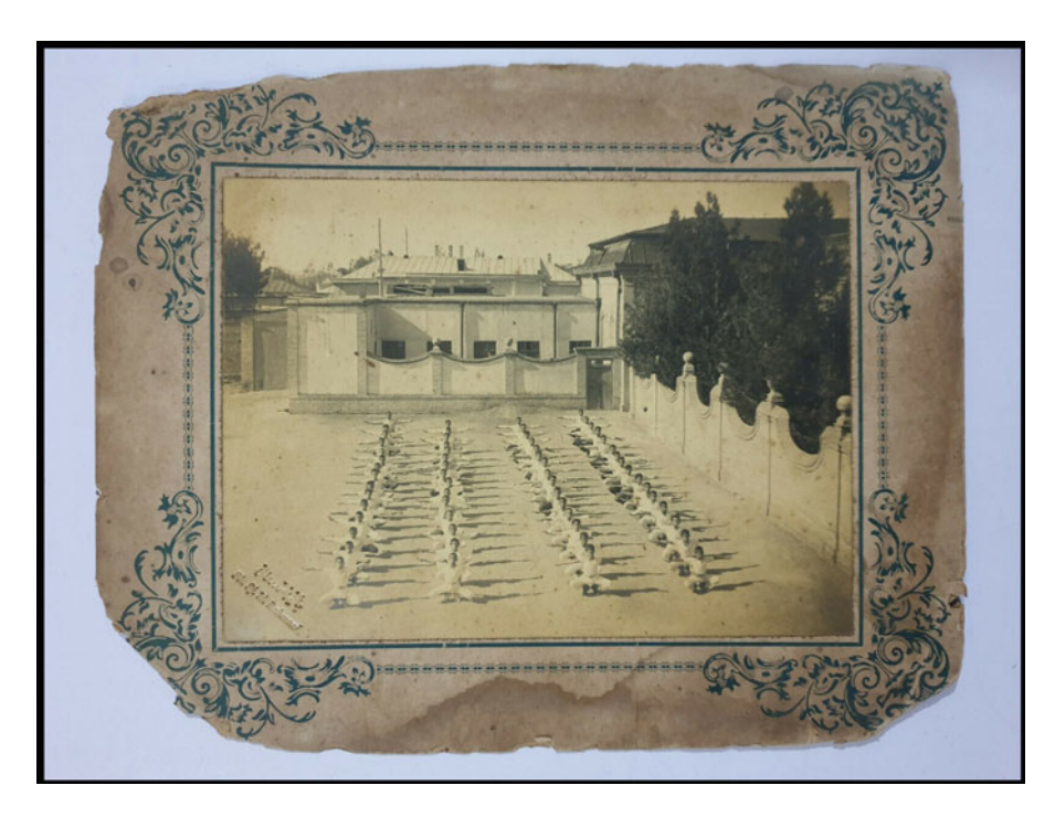
Figure 3. Students at the Marker school in Yazd engaging in physical culture activities. No caption, no reverse inscription.