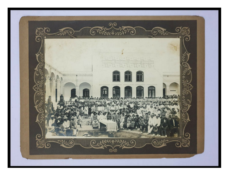
Figure 8. Another photo of Marker School courtyard taken during visit of Kaikhosrow Shahrokh. Reverse has English-language inscription that reads, "Meeting at Markerabad with Hn. Arbab Kaikhosrow Shahrokh—June 1936, Soroosh."