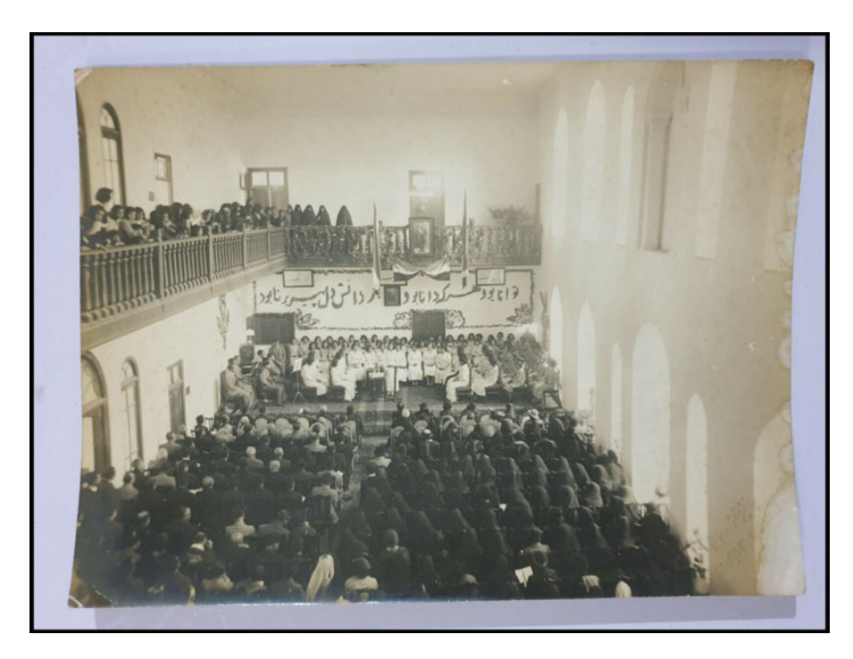
Figure 12. Convocation ceremony for female graduates. No date, no reverse inscription.