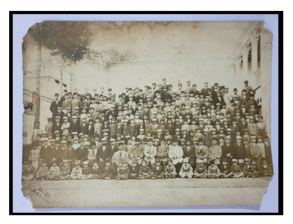
Figure 1. Male students at Marker Orphanage and Boys School, Yazd. Date unknown, likely 1934.