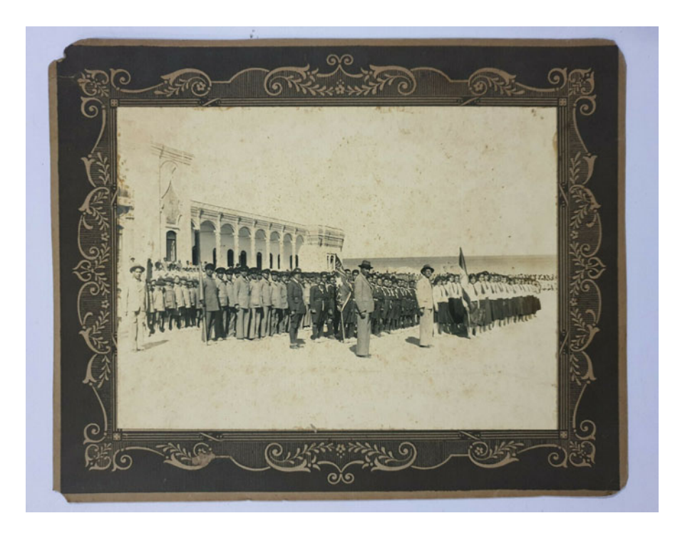
Figure 14. Boy Scouts and Girl Guides standing in formation in front of Central Hall of Marker Orphanage and Boys' School. Reverse side of photo has the following English-language inscription: "Some of the troops of the Marker Orphanage Boy Scouts and Marker Girls' School Girl Guides."