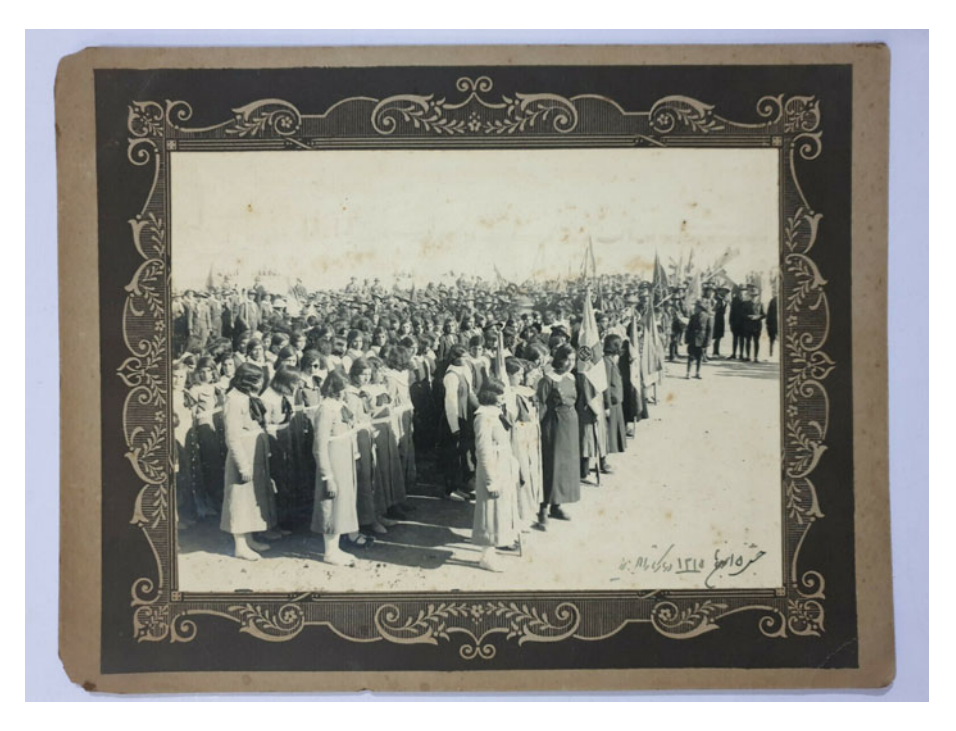
Figure 15. Caption reads, "Celebration of 15 Bahman, 1315, in Markerabad, Yazd" [February 4, 1937].