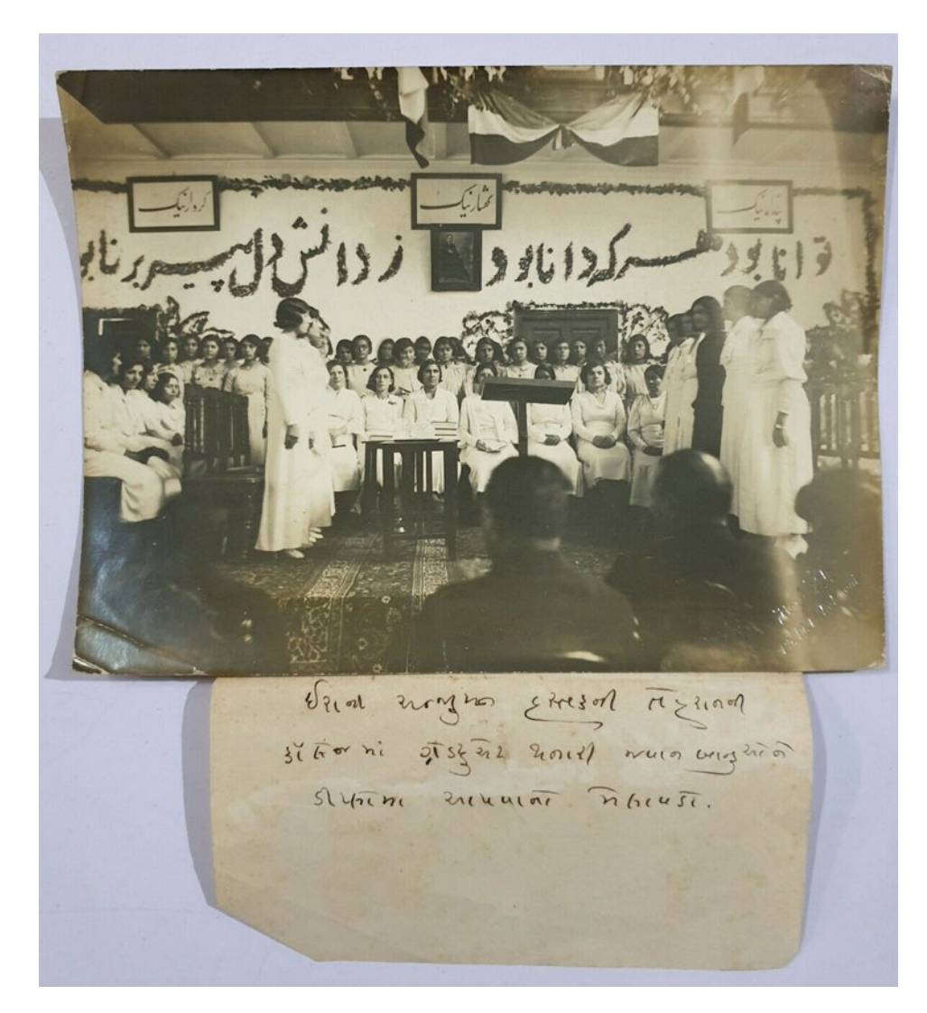
Figure 11. Convocation ceremony for female graduates. The handwritten Gujarati text reads, "Ceremony to grant diplomas to young women graduating from the Tehran college managed by the Irani Anjoman." The identity of this college or institution remains uncertain: there is the possibility that these are graduates of the Anushirvān Dādgar Girls' School in Tehran. The banner above the students reads, "All who are knowledgeable, are strong, from knowledge an old heart will become young" [tavānā bovad, har ke dānā bovad, ze dānesh del-e pir bornā bovad]. The three framed phrases above the motto constitute the Zoroastrian saying: Good Thoughts, Good Words, Good Deeds. No date.

and early twentieth centuries were periods of intensive institution-building for Parsis across India: schools and colleges, including girls' schools; orphanages; medical dispensaries and hospitals; gymkhanas and sports clubs; and, by the early twentieth century, social work enterprises for the employment of the poor or disadvantaged. These are precisely the types of institutions which were photographed in the album compiled by the Iranian Zoroastrian Anjoman. Here, Parsi readers would see their Iranian coreligionists' equivalents of familiar scenes, such as groups of female students (Figures 9–12) or boys engaging in physical culture activities (Figure 3). An assertive spirit of social reform is suggested by the assembly of women and young girls celebrating the one-year anniversary of Reza Shah's decree banning the veil (Figure 9) as well as a convocation ceremony for female