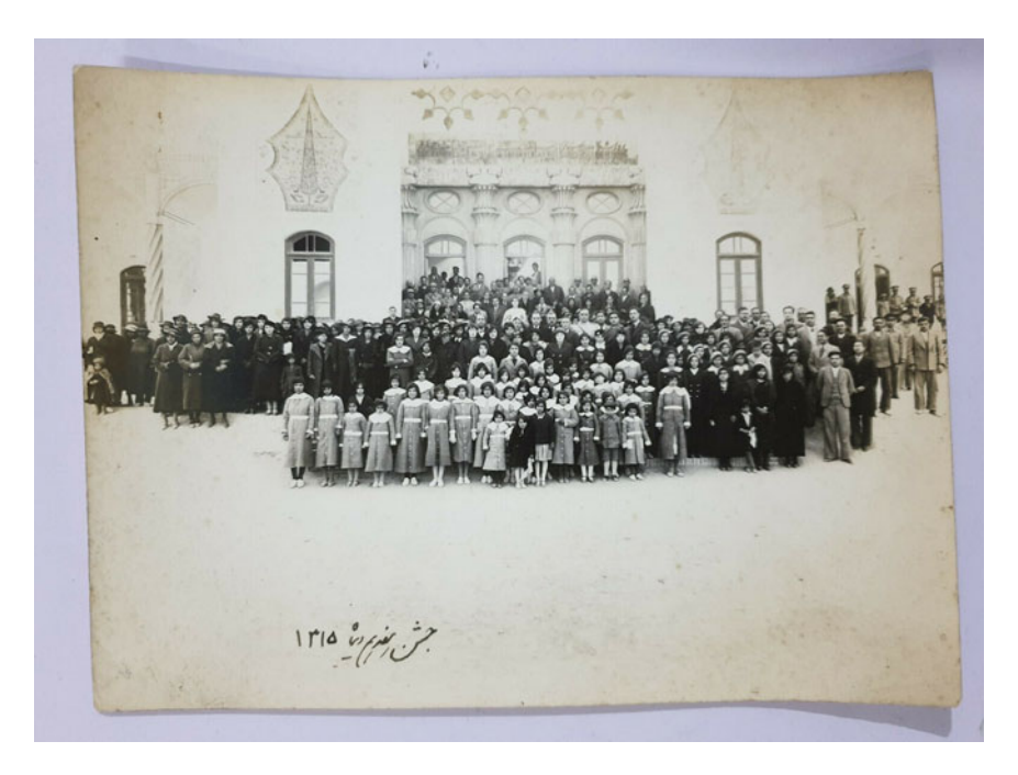
Figure 9. Caption reads, "Celebration of seventeenth of Dey, 1315 [January 7, 1937]." This is the one-year anniversary of Reza Shah's decree banning the veil. On reverse there is an English-language caption: "17th Dey 1315 The Anniversary of Iran Ladies' Emancipation."