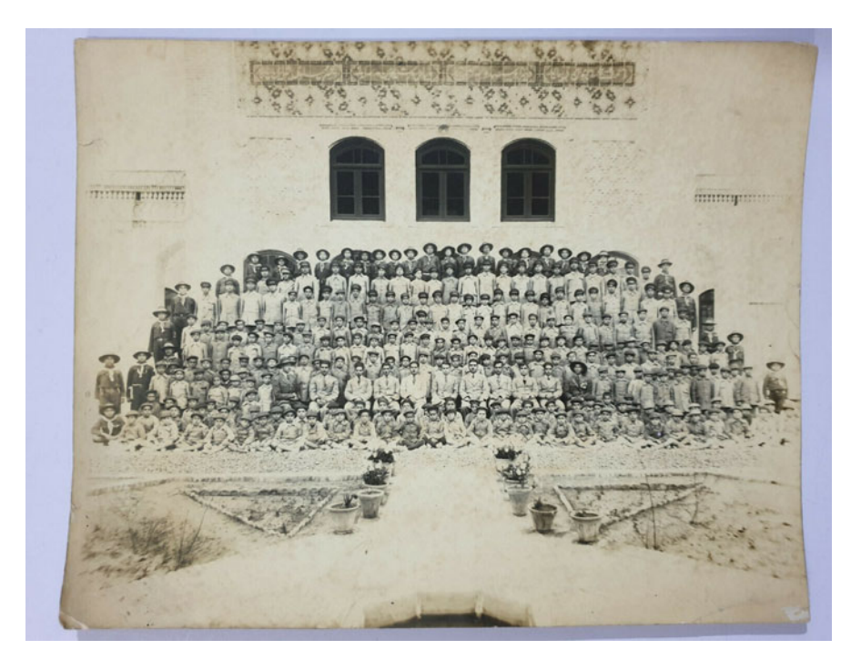
Figure 2. Reverse has English-language inscription reading, "The Anniversary of P.D. Marker Orphanage Opening Day, 12th April, 1936." Some are wearing scouting uniforms.