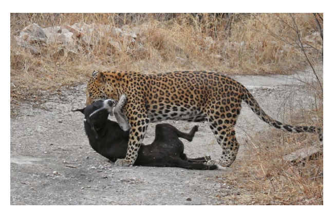
PLATE 1 Leopard Panthera pardus fusca preying on a domestic dog that strayed into the boundaries of Jhalana Reserve Forest.

<sup>2</sup>Y, mass of prey consumed per scat; D, relative biomass; E, relative per cent of each prey species consumed (see text for further details).