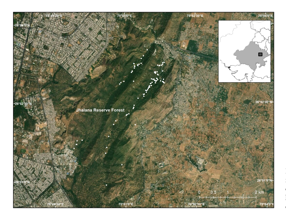
FIG. 1 Jhalana Reserve Forest in north-west India, and the surrounding city of Jaipur, with the locations of the leopard Panthera pardus fusca scats collected.

often feed opportunistically on easily accessible domestic prey (Athreya et al., 2013, 2014). We thus hypothesized that the leopards' diet comprises principally of domestic animals. Our objectives were to identify the leopards' key prey species and examine their importance for human– leopard coexistence and acceptance of the presence of leopards in the urban landscape (Kumbhojkar et al., 2019).