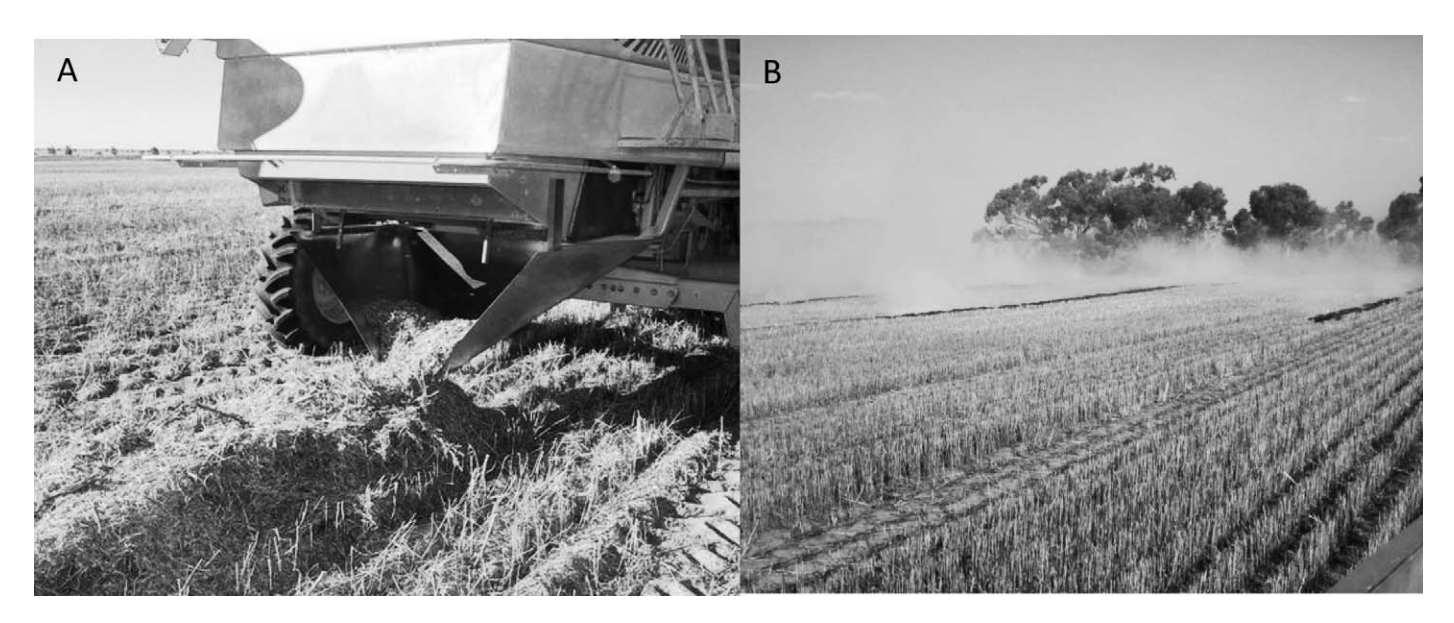
Figure 2 a) Chaff chute mounted on the rear of a harvester to form narrow windrows during harvest. b) Burning narrow windrows in wheat stubble in autumn (March to April)

Smith 1975). The biological attribute of seed retention at maturity in annual ryegrass, wild radish, and several other annual crop weed species, means that seeds are attached to the upright plant enabling the weed seeds to be collected (harvested) during grain crop harvest. For example, in field crops a large proportion (up to 80%) of total annual ryegrass seed production can be collected during a typical commercial grain harvest (Walsh and Powles 2007). These weed seeds enter the front of the grain harvester, are processed, and exit the grain harvester in the chaff fraction. An irony is that these "harvested" weed seeds are evenly redistributed across the crop field to become future weed problems. Thus, grain crop harvest presents an opportunity to target weed seed production, thereby minimizing replenishment/increase of the weed seedbank. As outlined below, harvest weed seed control (HWSC) systems have been developed in Australia to target and destroy weed seeds during commercial grain crop harvest, minimizing weed seed inputs into the seedbank (Walsh and Powles 2007).