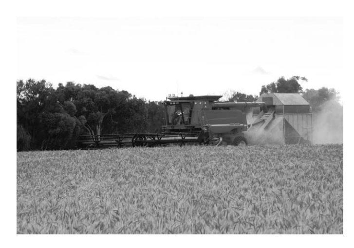
Figure 1. Chaff cart system in operation during commercial wheat crop harvest.

how a major herbicide-resistant weed problem has been the catalyst for the development of new non-chemical weed control techniques focused on weed seed capture and destruction during commercial grain crop harvest. We illustrate how the inclusion of these techniques in weed control programs allows weed populations to be driven to and maintained at very low levels. Finally, we speculate on the potential for at-harvest weed seed targeting technologies in global field crops.