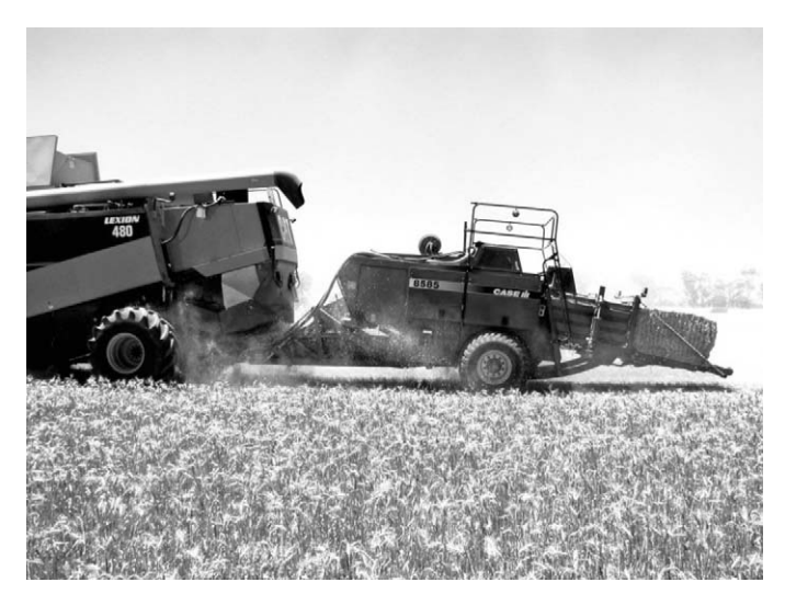
Figure 3. Bale direct system collecting and baling chaff and straw residues during wheat harvest.

the weed seeds present from returning to the cropping field. The large volume of collected chaff is typically dumped in chaff heaps in lines across fields in preparation for subsequent burning to achieve weed seed destruction. Alternatively, chaff material is a valuable livestock feed source and can be grazed in-situ or, in some instances, collected for use in feed-lots. This necessity for post-harvest management of chaff material has limited the Australian adoption of chaff cart collection systems despite their recognized efficacy in the management of major herbicide-resistant weed problems. However, the weed seed targeting efficacy of chaff cart collection systems (Walsh and Powles 2007) maintained the continuing interest in the development of additional HWSC systems.