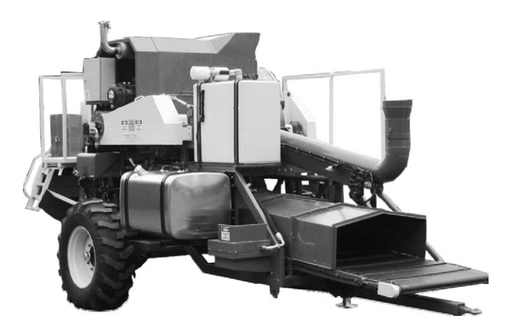
Figure 4. First commercially available Harrington Seed Destructor

Narrow windrow burning. The simple but effective narrow windrow burning system is currently the most widely adopted HWSC system in Australia. This inexpensive system uses a grain harvester mounted chute to concentrate all of the exiting chaff and straw residues into a narrow-windrow (500 to 600mm) (Figure 2a). These narrow windrows are subsequently carefully burnt under the right environmental conditions, avoiding burning the entire crop field (Figure 2b). The concentration of chaff and straw residues increases the duration and temperature of burning, creating the highest potential for weed seed destruction. Weed seed kill levels of 99% for both annual ryegrass and wild radish have been recorded from the narrow windrow burning of wheat, canola, and lupin (Lupinus angustifolius L.) chaff and straw residues (Table 1, Walsh and Newman 2007). The simplicity and low cost of this narrow-windrow system has resulted in its adoption by an estimated 70% of crop producers in the major grain production state of Western Australia.