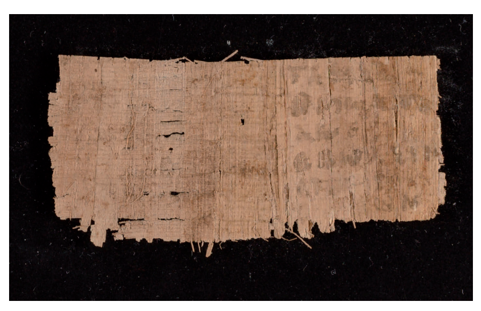
The Gospel of Jesus's Wife fragment, verso (prior to sampling for radiocarbon testing).