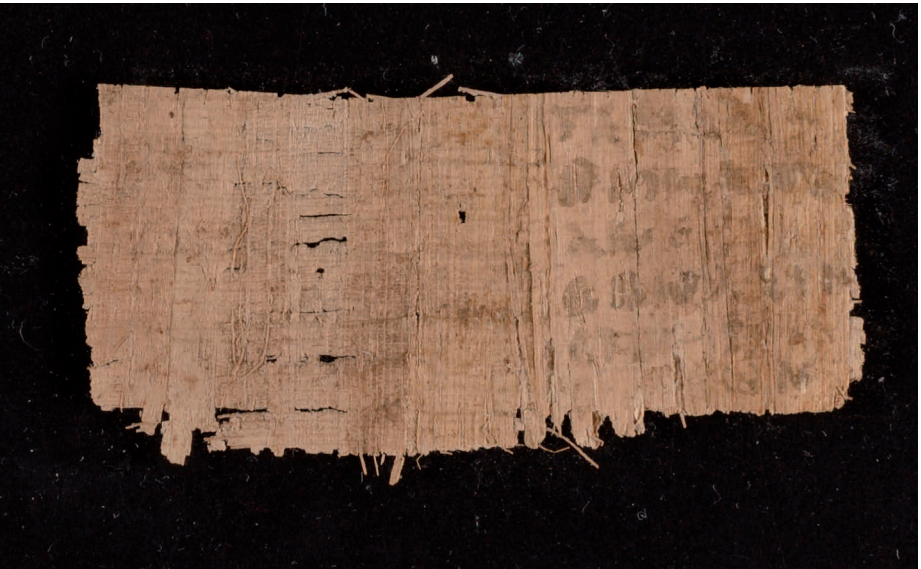
The Gospel of Jesus's Wife fragment, verso (prior to sampling for radiocarbon testing).