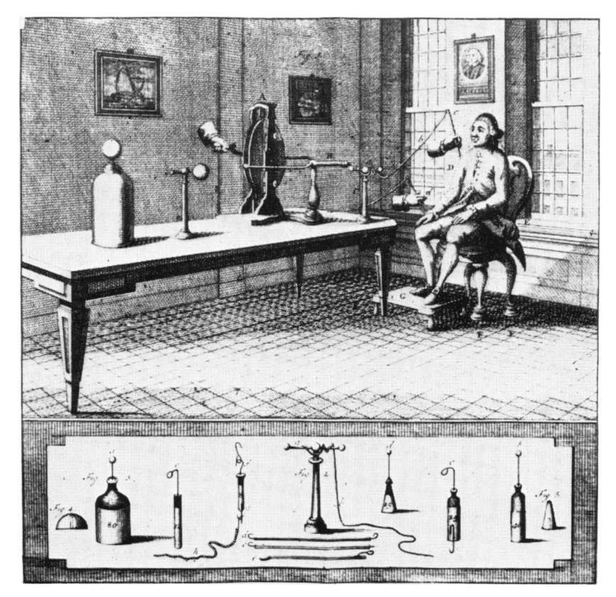
Plate III Passing an electric discharge through a part of the patient's body.