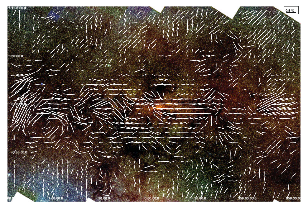
Figure 2. Near-infrared mosaic image of the Galactic center region covering 3.0^{\circ} \times 2.0^{\circ} in the Galactic coordinate, taken with the IRSF telescope and NIR camera SIRIUS. The three NIR bands are J (blue, 1.25\mu m), H (green, 1.63 \mu m), and K_S (red, 2.14 \mu m). Observed polarization angles for the Galactic center components in the K_S band are also plotted with white bars whose length indicates the degree of polarization. [A COLOR VERSION IS AVAILABLE ONLINE.]

The obtained polarization map (Figure 2) suggests a large-scale toroidal MF configuration in the NB. The histogram of the MF directions at |b| < 0.4^{\circ} has a clear peak at 90° (see Figure 5 in Nishiyama et al. 2013) which is the direction parallel to the Galactic plane. At high Galactic latitude ( |b| \gtrsim 0.4^{\circ} ), the fields are nearly perpendicular to the plane, i.e., poloidal configuration. This suggests a transition of the large-scale configuration, and such a transition can be naturally explained by the time evolution of MFs. The transition region, |b| \sim 0.3^{\circ} to 0.4^{\circ} , is in good agreement with the scale height of the 6.7 keV emission, 0.27^{\circ} (Uchiyama et al. 2013).