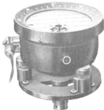
Campbell Bennett Aperiodic Compass.

Smith's Aviation Instruments are entirely British made at their fine factory at Cricklewood, London, N.W.2, and include Revolution Indicators, Airspeed Indicators, Altimeters, Pressure Gauges, Petrol Level Indicators, etc., etc., in fact, every aviation need is fully catered for.