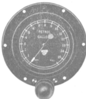
Smith's Petrol Level Indicator.

It is a significant fact that whenever a world's record or big international flight takes place Smith's Instruments are invariably fitted to the winning machine. Their reliability and accuracy has gained for them the reputation of being the leading aircraft instruments of the world.