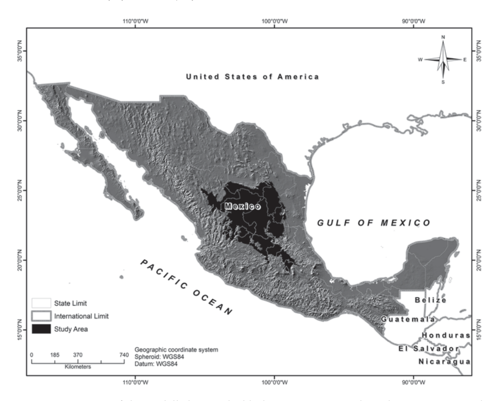
Figure 1. Location of the modelled area. The black region corresponds to the 'Meseta Central Matorral' (MCM), delimited as 'M' according to Soberón and Nakamura (2009).