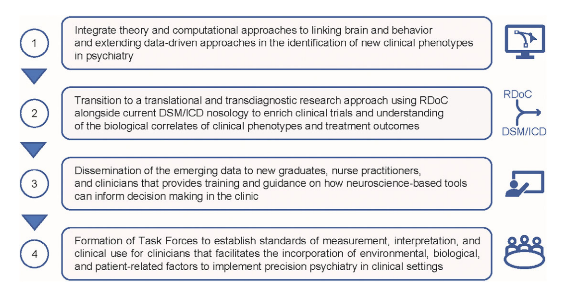
Figure 3. Proposed steps in the implementation of precision psychiatry.

Secondly, a translational and transdiagnostic research culture that encourages the complementary use of RDoC alongside current DSM/ICD nosology is important in the immediate future to enhance clinical trial outputs. RDoC can function within current DSM/ICD diagnoses, enriching current clinical trials and making significant contributions to our understanding of the biological correlates of clinical phenotypes through the mining of existing clinical and biological datasets.