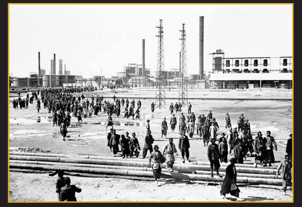
SPECIAL SECTION: SOCIAL HISTORY OF IRANIAN OIL WORKERS SECTION EDITOR: Touraj Atabaki