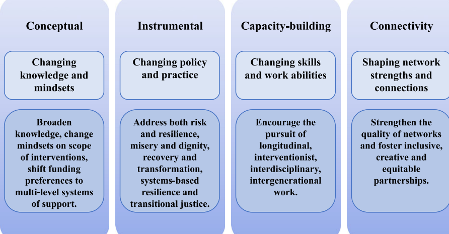
Figure 1. Four types of impacts defining the added-value of multisystem research and intervention.

intergenerational in significance. The fourth category of impacts has to do with connectivity, shaping the existence and strength of networks that inter-link people and organizations making use of research evidence. With an eye to strengthening the quality of our networks, we can strive to be more inclusive in terms of North-South collaborations, and more creative and equitable in our relationships when it comes to research, analysis, and publication. In terms of working with people in the wake of war and forced displacement, these four types of impacts might entail 'making a difference' with respect to the conceptualization of mental health support, the scope and modalities of programs implemented, the skills learnt and practices adopted during research activities, and the formation of creative, enduring partnerships (Panter-Brick, 2022). It is thus worth reflecting on types of impacts, as well as evidence, in examining how research will be meaningful for policy and practice.