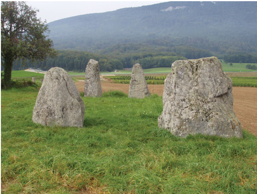
Figure 1. The archaeological site of Corcelles-Concise (CH).