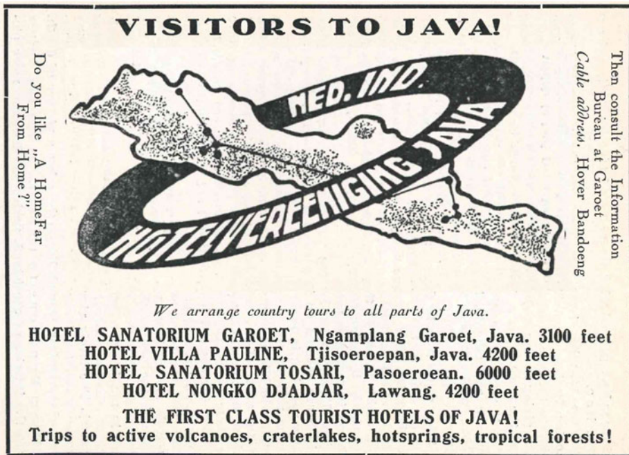
Figure 2. Advertisement for the Netherlands Indies Hotel Association (NIHV).

States and Australia. By offering the benefits of booking vacation itineraries through a single company, together with the OTB these efforts generated about 3,200 foreign tourists annually during the late 1920s. 32