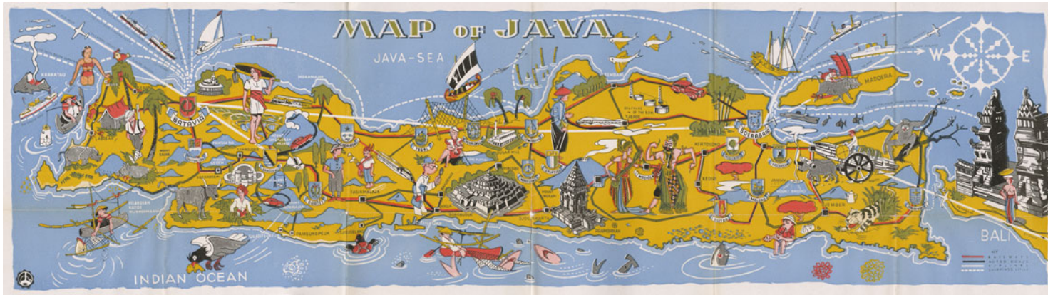
Map I. Tourist map of Java.