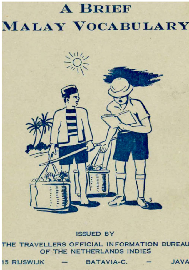
Figure 6. Cover of the OTB's A Brief Malay Vocabulary with a Few Useful Phrases and Sentences Rendered into Both the English and the Netherlands Language (Batavia: Kolff, 1940).

servant, djongos , was translated to the English “boy”—i.e., “Be careful, boy”—a loaded and racist term in the Anglophone world denoting someone considered to be socially, culturally, and racially inferior. And tellingly, the booklet did not include any language indicating politeness or courtesy toward natives; translations for mundane civilities like “please” and “thank you” are nowhere to be found. 76 Such materials made it clear that indigenous people were there to serve Western tourists and should be treated accordingly.