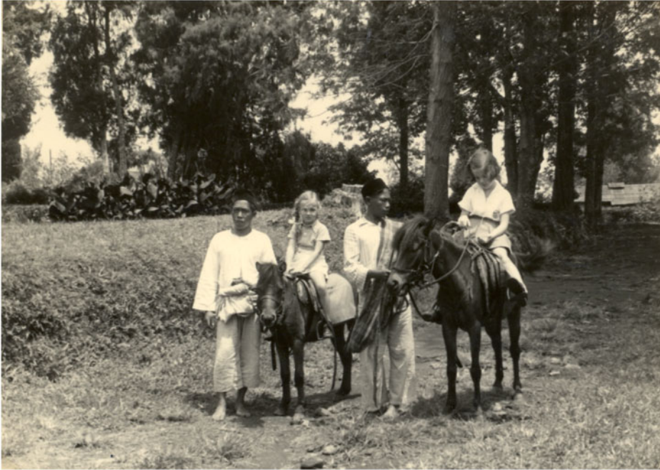
Figure 5. The “contact zone”: Dutch children on ponies escorted by two Javanese servants. KITLV, 55046.

to preserve the myth of harmonious and benevolent Dutch rule, for a moment the façade had dropped.