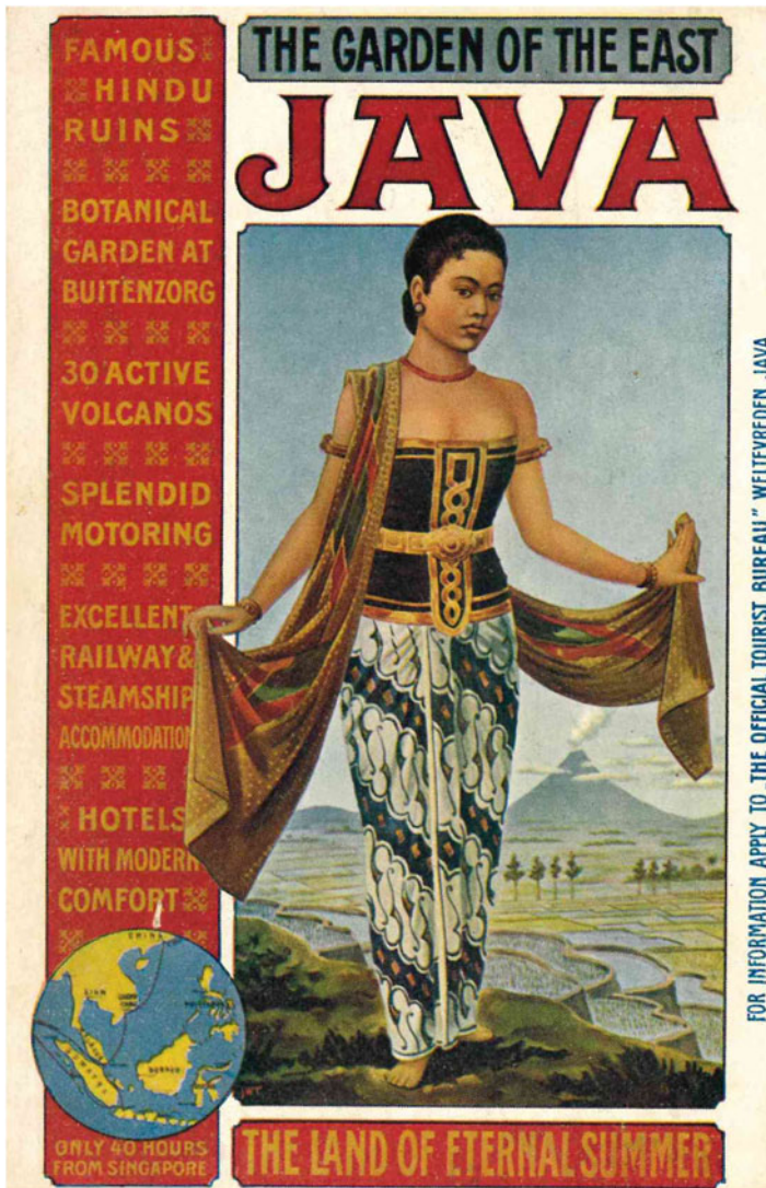
Figure 4. Java, The Land of Eternal Summer , picture postcard, The Official Tourist Bureau (ca. 1920s). Private collection.

Due to this campaign, the number of international visitors from Australia, the United States, Britain, France, and their respective Asian colonies increased rapidly on the eve of the First World War, growing from a few hundred to more than four thousand annually, and returned to prewar levels in the 1920s. 62 While these numbers may seem low, they reflect that international travel was a privilege for global elites—the lucky few who could spare time and money to tour the world. 63 More importantly, from the OTB's