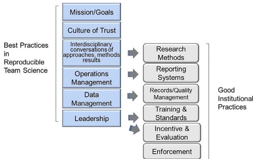
Fig. 2. Best practices in reproducible team science support the culture of good institutional practices (GIPs). Mapping the best practices in reproducible team science with the six GIPs proposed by Begley et al.

psychologically safe environment, leadership listens to all voices, encouraging all team members to participate in a meaningful way. Team members learn to share failures, ask questions, and challenge the assumptions of others, in a respectful way that encourages open discussion and debate and discourages personal attacks. Team members meet their commitments and trust colleagues to do the same.