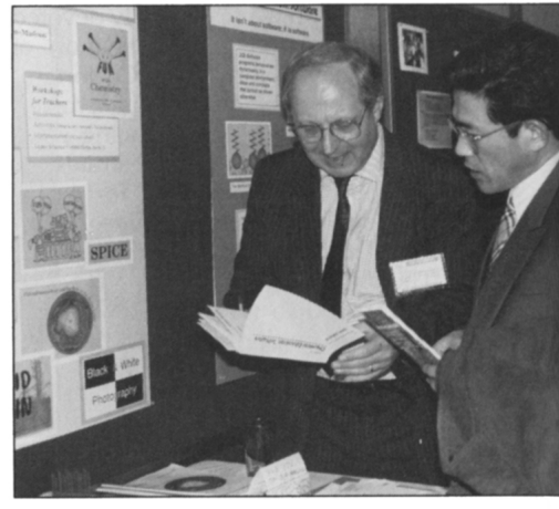
Poster session attendees discuss ideas for K-12 science education activities.

Recent progress in the intermetallics area was summarized during Symposium L, High-Temperature Ordered Intermetallic Alloys - V. In addition to structure, phase stability, and deformation behavior, this symposium also emphasized other properties of technological interest such as creep, fatigue, fracture, toughness, environmental effects, processing, and joining. Intermetallic systems discussed were titanium aluminides, nickel aluminides, iron aluminides, silicides and advanced intermetallics such as beryllides. Several papers demonstrated the effect of the test environment in many intermetallics. The paper by C. L. Fu of Oak Ridge National Laboratory presented calculations of point defects in NiAl, FeAl, and TiAl. The role of mobile dislocations in controlling room temperature ductility and toughness in NiAl was demonstrated, through strain aging experiments, by J. E. Hack of Yale University. Creep behavior of NiAl was discussed in an excellent presentation by W. D. Nix of Stanford University. Excellent fatigue behavior of NiAl was discussed in several