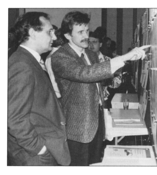
Meeting attendees swap research results at one of four evening poster sessions.

The transformation of C_{\omega} (but not C_{\omega} ) to diamond under high pressure and the