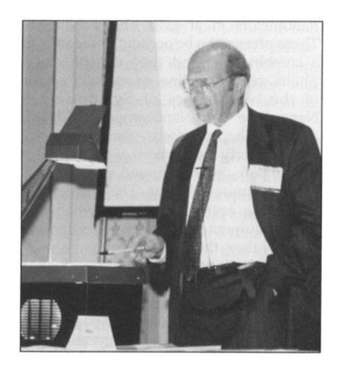
Peter Hirsch, former chairman of the Atomic Energy Authority in the United Kingdom, addresses policy issues in the Society-Wide Colloquium on ''National Materials Policies in the Era of International Science and Technology.''

Symposium I, Laser Ablation in Materials Processing: Fundamentals and Applications, attracted researchers involved in laser ablation of polyimides, ceramics, high T<sub>c</sub> superconductors, semiconductors, ferroelectrics, metals, and diamond-like films. The diverse selection of materials be-