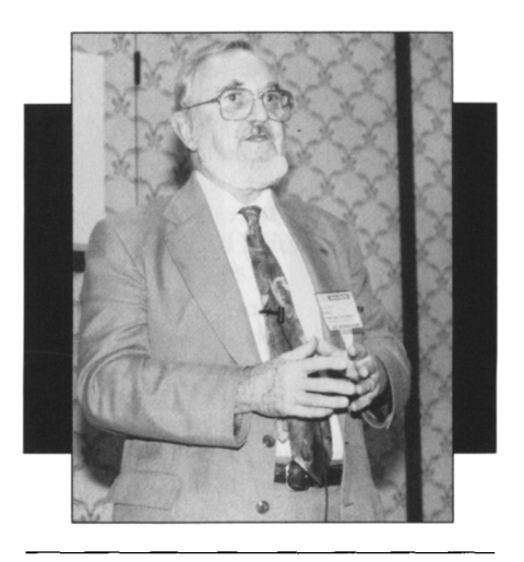
Eric Cross, 1992 MRS Medalist, gives his award lecture on relaxor ferroelectrics.

The second area was light-emitting porous silicon and related materials. Since the demonstration in 1990 that bright, visible light can be emitted by porous silicon, the field has expanded considerably. The sessions were devoted to fabrication of silicon and germanium nanostructures, characterization of porous silicon, theory of