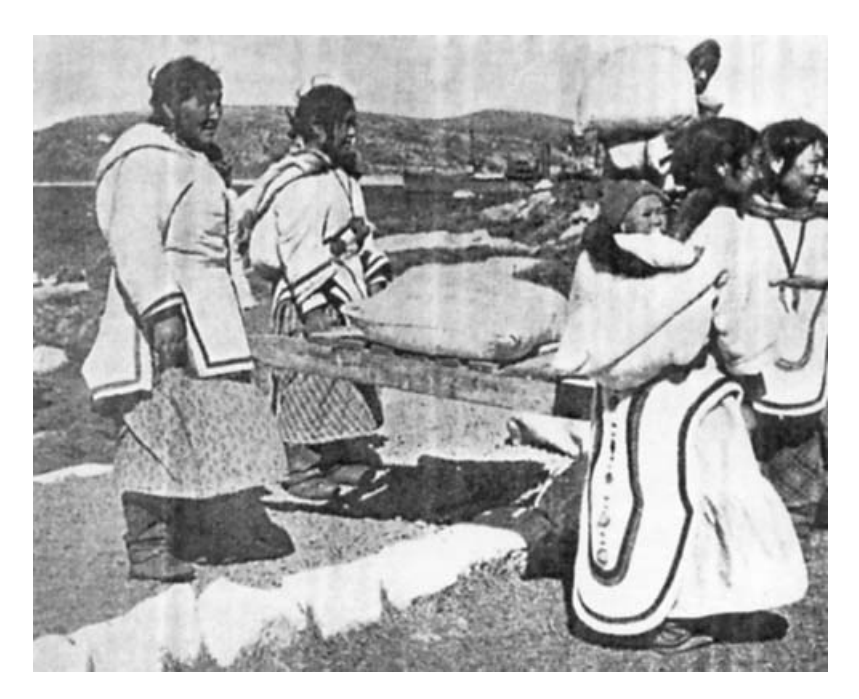
Figure 2. Women often combined familial labour with work for wages. Inuit women unloading flour from the HBC ship at Cape Dorset. The Beaver, March 1943 , p. 38.

ammunition pouches; repairing traps; preparing food; and of course, caring for children, husbands, and parents.<sup>57</sup>