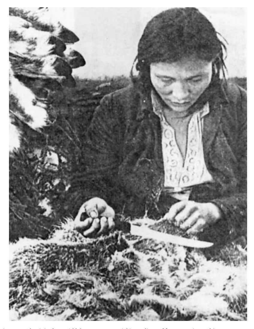
Figure 1. Aboriginal unpaid labour was a crucial ingredient of fur extraction. Chipewyan woman using a sharp knife on caribou hide.

The Beaver, March 1948, p. 13. Photographer: Richard Harrington.