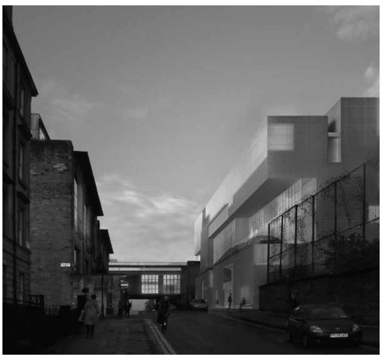
4 Steven Holl, Glasgow School of Art, visualisation as seen from Renfrew Street, 2011

simply a facet of durability, it is the capacity by which the plan and section can take up shifts from the user, offering a multiplicity of possibilities in use. James Stirling, who absorbed the writings of Le Corbusier and for whom the section was the allimportant generator of form - a thesis best exemplified in the four university projects at Leicester, Oxford, Cambridge and St Andrews - observed that all built form has height and properties of stability dependent upon shape, and the necessity in making a grouping of accommodation that is inherently stable. The disposition of forms at Leicester - the tower counterbalanced by the lecture theatre - is a case in point. No doubt there is an architectural quality inherent in the composition of stable images particularly when they are asymmetrical. The 'balance' in the Steven Holl Architects section, developed by partner Chris McVoy, is particularly apparent when viewed as part of the overall cross-section of Renfrew Street with the Mackintosh building: the 'Elbow' in the light tubes, the recess enveloping the Machar, the roofscape. There is also a semiology emanating from the building from a distance. Glimpsing it from the M8, the voids coming through the top are as La Tourette close up yet, from a distance, the building geometry reads as an engine block displaying the triple carburettors