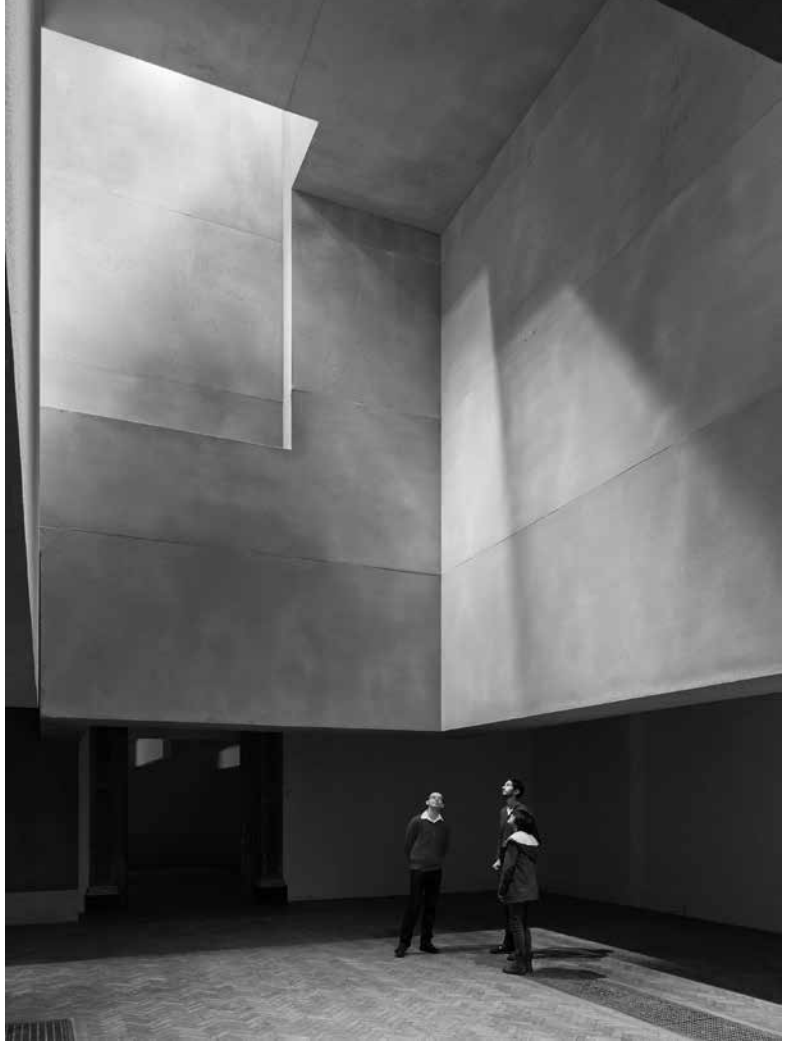
1 Visitors immersed in Grafton Architects' 'weighty' installation

Souto de Moura – door linings replicated in cast concrete and placed adjacent to the original opening – was cerebral and austere. Kengo Kuma's rooms – two dark spaces with an illuminated bamboo lattice – were highly sensual; the fugitive nature of the scent matched the ethereal