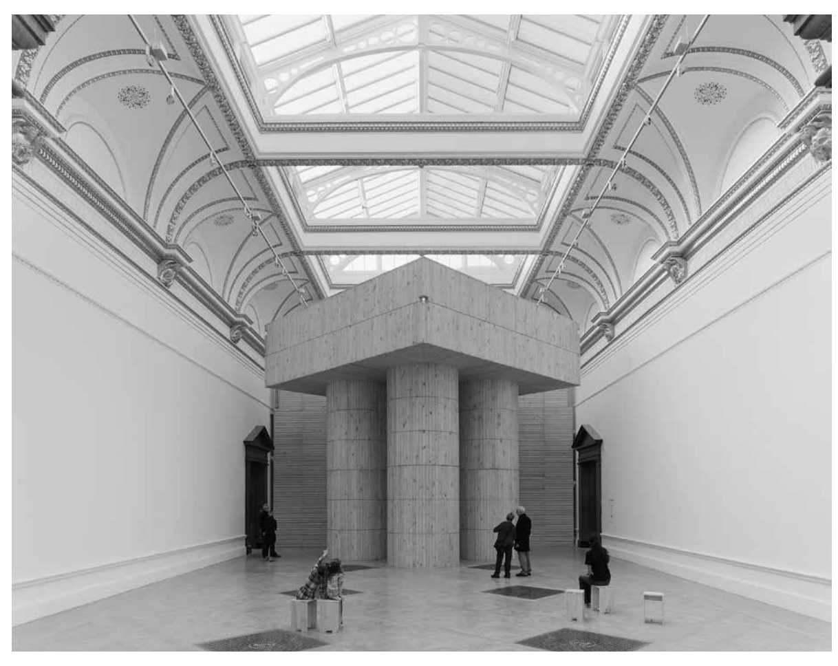
{\tt 2} \quad {\tt The journey\,through\,the\,gallery\,space\,curated\,by\,Pezo\,von\,Ellrichshausen}

spaces formed by the bamboo webs. Li Xiaodong seemed to be creating a vernacular space of bamboo screens, guiding visitors though a spatial experience. The work of Grafton Architects was entirely suspended from the ceiling, and they had thoughtfully included benches as part of their installation to allow visitors to gaze up at it. People will choose their own favourites according to their own interests.