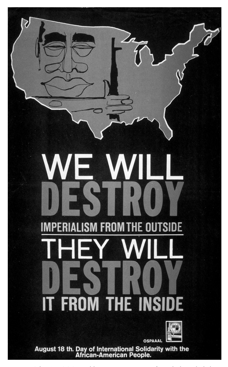
FIGURE 0.1 The OSPAAAL publication Tricontinental regularly included posters highlighting specific movements and their relationship to the larger anti-imperial struggle, a practice that established both a roster and an iconography of revolutionary radicalism. This poster captures a common theme related to solidarity with the African American struggle, but it also points to the revolutionary logic uniting state and nonstate actors. OSPAAAL, artist unknown, 1967. Offset, 52x31 cm.