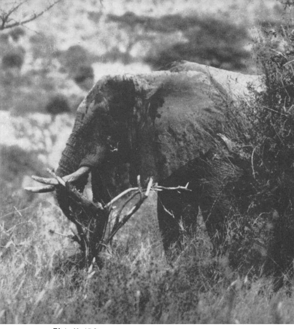
Plate 12: 'SCRUBLAND' ELEPHANT with drooping head, showing signs of chronic ill health. This animal was blind in one eye and also showed some dysfunction of the trunk. Sylvia K. Sikes.