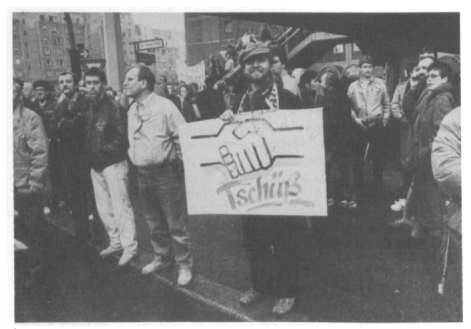
Figure 1 Banner with fraternal hands and Tschüβ (bye-bye): protest demonstration in East Berlin, 4 November 1989

and the art college, for example, which had access to large stocks of cloth or black curtain material, many factories only had stocks of red material to fall back on for large banners.