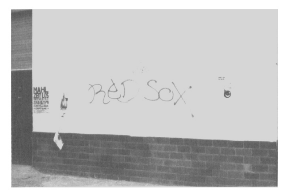
Figure 3 Graffiti in East Berlin, October 1992

'red songs'. But now it has happened that we sing workers' songs, not passionately but with gentle irony". How frequent such cases are remains unknown. But they do prove the existence of a tendency to continue to use left-wing symbolism playfully or, to quote Gottfried Korff, "ludically", although in these instances they do not appear to have "shed their political significance". Rather, they illustrate new, non-authoritarian, individual and popular-cultural usages with political identities.