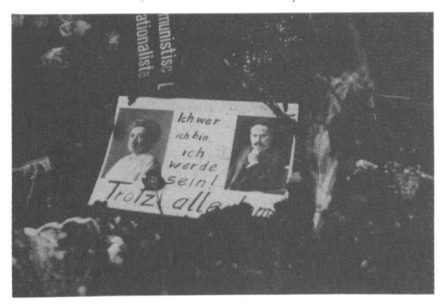
Figure 4 Text at Rosa Luxemburg's and Karl Liebknecht's graveside, January 1992 of was, I am, I will be. In spite of all that"

the socialist revolution, "I was, I am, I shall be" (Figure 4), and formulations such as "Karl and Rosa live in our word" are used." Or when the site of the Lenin monument was decorated at Easter 1992 with a picture of Lenin and a bunch of spring flowers.